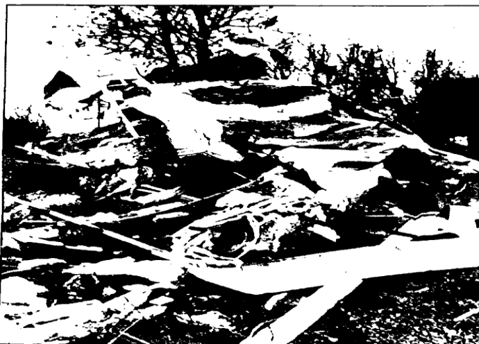
Remnants of mobile home hit by a tornado Saturday lie scattered in Lecanto. No one was in the home at the time.

Areas where the tornado did damage