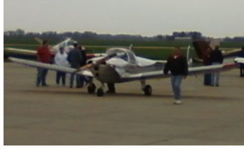
Photo from the event (left, below)

"NWS-Topeka meteorologists set up a booth in the dining area to provide live, real time weather information to participants"