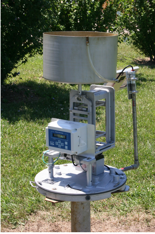
Figure 2: A new Sutron data-logger.

tape punch readers used to transcribe and archive F&P collected data have been identified as high-risk of failure and replacement equipment is no longer available.