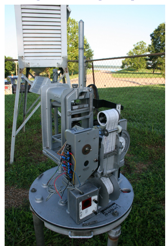
Figure 1: An original F&P gauge. disk

position. This code disk position was recorded on punched paper tape at 15 minute intervals (See Figure 1). At the beginning of a given month, the Cooperative Observer at the site