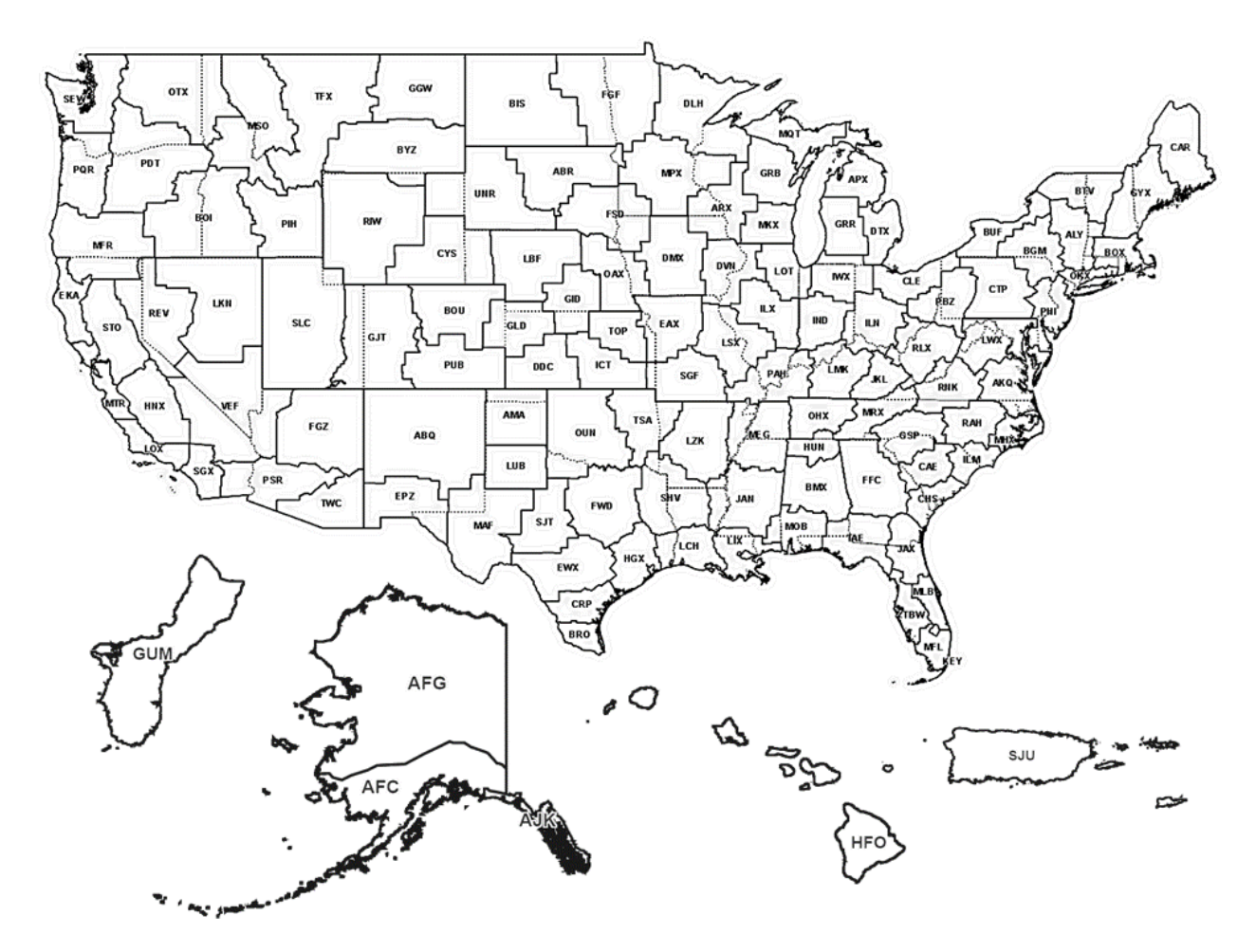
Figure 2. WFO Hydrologic Service Areas (HSA).

Detailed HSA definitions, maps, and descriptions of WFO hydrology program support responsibilities are contained in supplements to this directive issued by the NWS regions. When an HSA boundary needs to be adjusted between two or more WFOs, the offices first conduct the required coordination and notification process with regional headquarters and the OPR for this directive. When an HSA boundary change is to take effect, WFOs work with the GIS focal point in the Office of Dissemination to modify the shapefile used to generate the national HSA map. The national HSA map can be found in the NWS GIS Portal at https://www.weather.gov/gis/HSABounds. A national HSA map is shown in Figure 2.