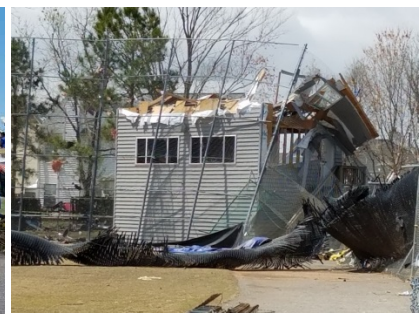
Landstown High School