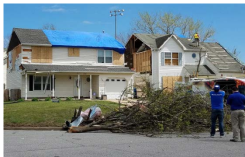
Stone Gap Dr