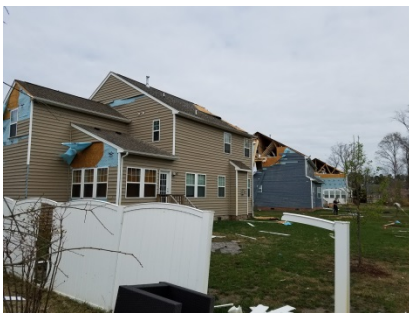
Kemp Bridge Dr.

The National Weather Service wishes to thank both Chesapeake and Virginia Beach Emergency Services for outstanding support during the tornado survey. Both agencies provided detailed maps of damage areas along with excellent footage.