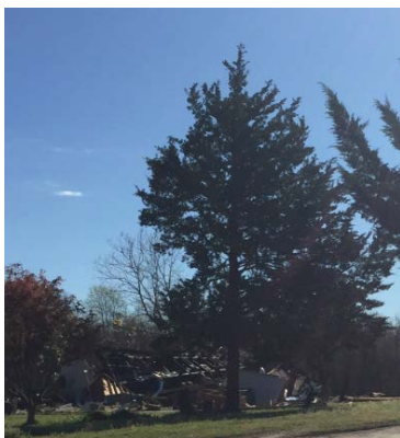
Mobile Home at Quebec Rd.

NWS storm survey determined that an EF1 tornado caused an intermittent damage path nearly 5 miles long and 50 to 100 yards wide. Initial damage, mainly to trees, was seen along and just west of Sally Freeman rd., about a mile south of Powellsville NC . The tornado tracked east-northeastward, crossing Rt. 42 near Rockpile Rd., where additional damage to trees and a mobile home were seen. The path then continued to Quebec rd., north of Rt. 42, where multiple trees were downed, some farm buildings were damaged, and a mobile was overturned and destroyed. The tornado weakened as it moved into the wooded area adjacent to the location of the damage mentioned above. The damage was most intense near the northeast end of the track.