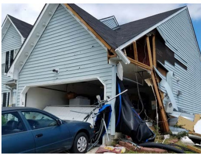
Rock Lake Loop