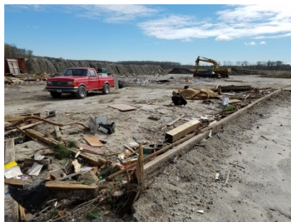
Mobile Home near Kemp Bridge Dr