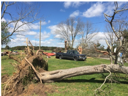
White Marsh Rd near Suffolk, VA

NWS storm survey determined that an EF1 tornado touched down along and just west of White Marsh Rd. about 2 miles southeast of downtown Suffolk. A number of trees were downed or snapped off, and one outbuilding was destroyed. The debris from that outbuilding damaged the adjacent house. The tornado crossed White Marsh Rd., where it entered the Great Dismal Swamp, and was no longer visible. Based upon radar data, and the discovery of minor tornado damage on the east edge of the Dismal Swamp in the Deep Creek section of Chesapeake, the decision was made to extend the tornado track to connect the Suffolk damage to the Deep Creek damage. This brings the total tornado path to nearly 12.5 miles.