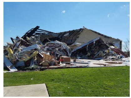
Real Life Christian Church