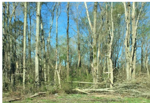
Tree Damage Sally Freeman Rd