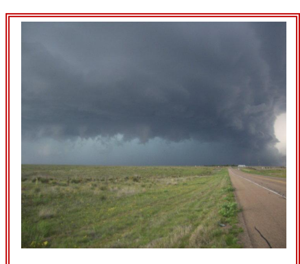
High precipitation supercell west of Dumas.

The next three weeks were relatively slow with only a handful of severe weather occurrences. One of the most impressive individual storms of the season occurred during the afternoon and evening hours on May 18<sup>th</sup>. A lone supercell storm developed over southern Hartley County around 4 PM and quickly became severe, producing golf ball size hail shortly after 5 PM. Before exiting Hartley County, this storm became tornadic, producing baseball size hail and the first of many tornadoes between Hartley and Channing. As this storm moved into Moore County, it encountered increasing low level moisture and morphed into a cyclic high-precipitation supercell. Another tornado developed approximately 11 miles west of Dumas with continuous reports of golf ball to