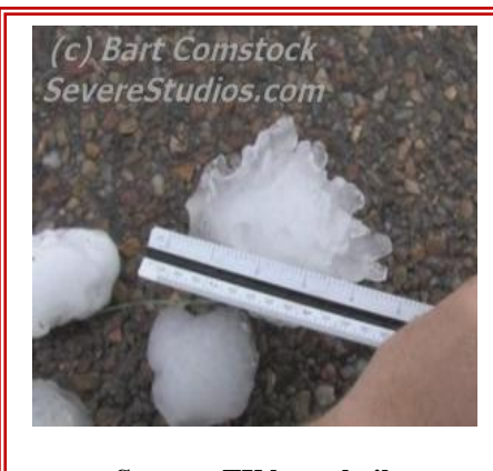
Sunray, TX large hail

The first half of June was relatively active as well, with significant severe weather reported on June 12<sup>th</sup> ·13<sup>th</sup> and June 18<sup>th</sup>. On June 12<sup>th</sup>, a very unstable atmosphere supported massive supercell thunderstorms that produced extremely large hail near Sunray. One storm chaser sustained damage to his vehicle due to hail that was approximately 6 inches in diameter. To put this in comparison, the largest hailstone ever officially measured had a diameter of 8 inches.