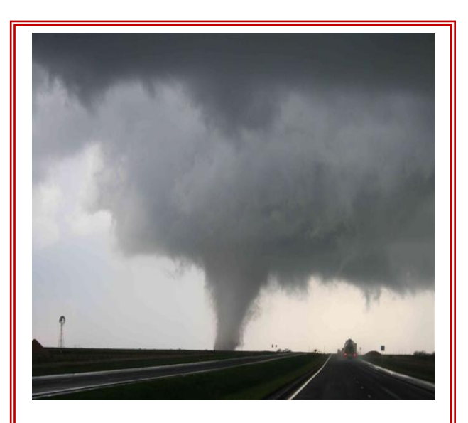
Tornado that crossed Highway 287 just west of Goodnight, TX.

With an El Niño pattern looming over the eastern Pacific Ocean during the winter months, National Weather Service meteorologists in Amarillo anticipated an active and early severe weather season for the Texas and Oklahoma Panhandles. That prediction turned out to be only half true. Spring began a bit on the sluggish side with no severe weather reported across the forecast area through early April. However, things began to change quickly by mid April as the pattern became more conducive for severe weather. The active weather pattern continued through mid June, consistent with local climatology. This article highlights the significant severe weather events observed in the Texas and Oklahoma Panhandles during the spring of 2010.