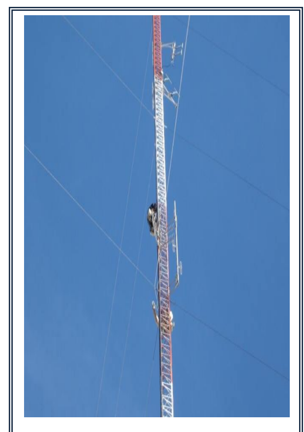
TRICO Tower employee working on the Perryton Transmitter