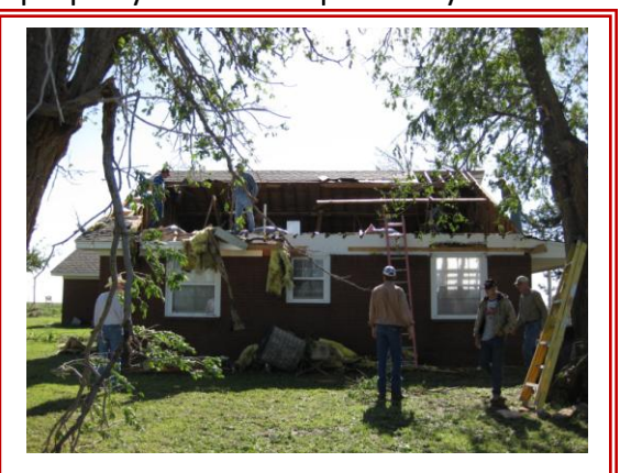
EF2 storm damage sustained by home 3 miles south southwest of Pringle.

Additional tornadic storms developed as the evening wore on, with six additional tornadoes reported from near Conlen (in Dallam County) to 14 miles southwest of Wolf Creek Park (in Ochiltree County). In a strange coincidence, one of these later tornadoes struck the same property that was impacted by the earlier tornado near Pringle.