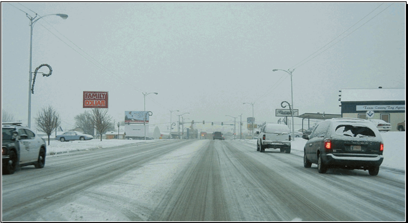
Snow covered US Highway 64 approaching 15th Street in Guymon (Texas County).

Beaver County: 10 E Beaver 2.0 inches; Beaver 1.5 inches.