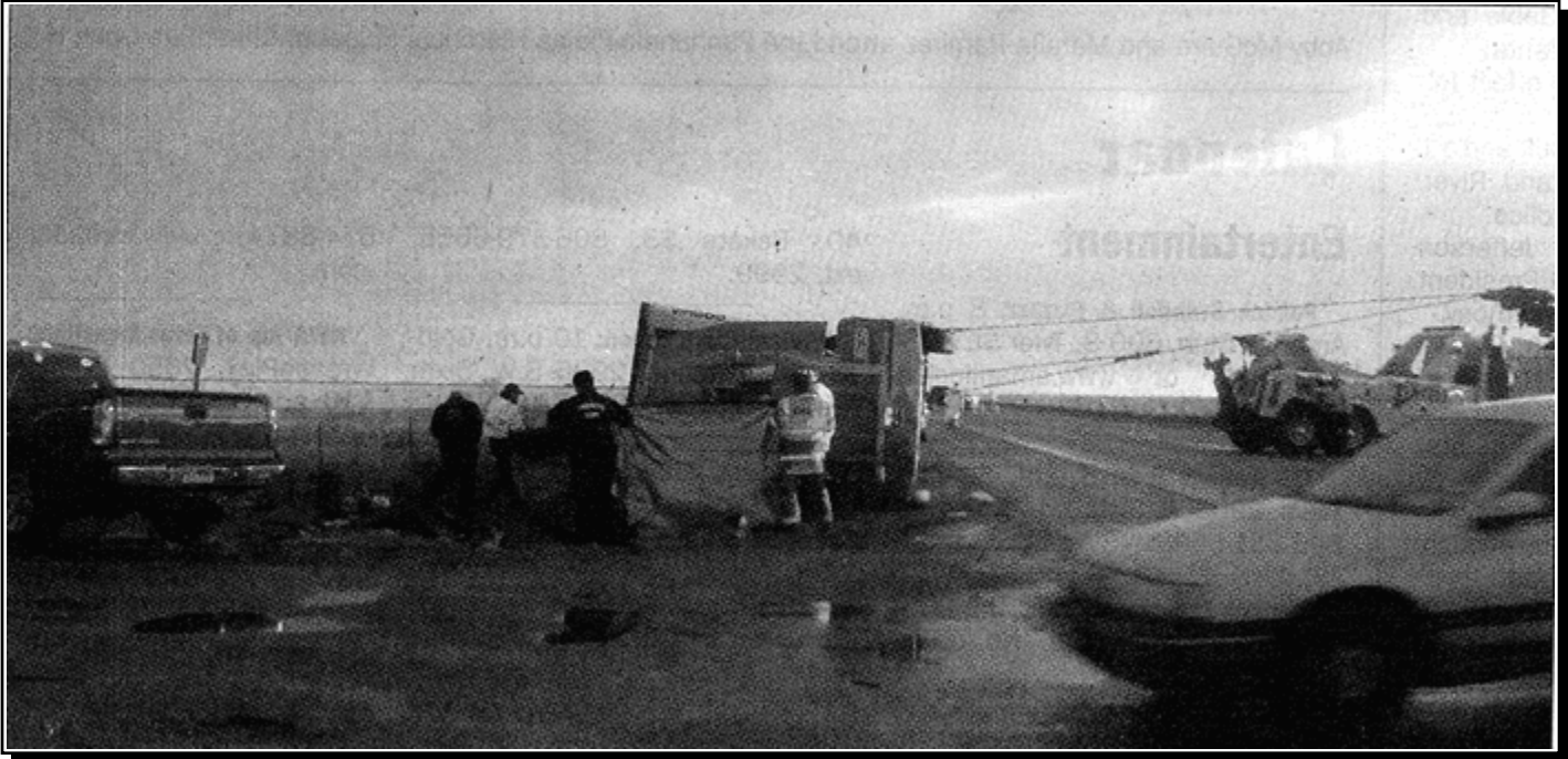
The scene of a rollover accident at the intersection of McAfee Road and Washington Street.

Location Date/Time Deaths & Injuries Property & Crop Dmg Event Type and Details