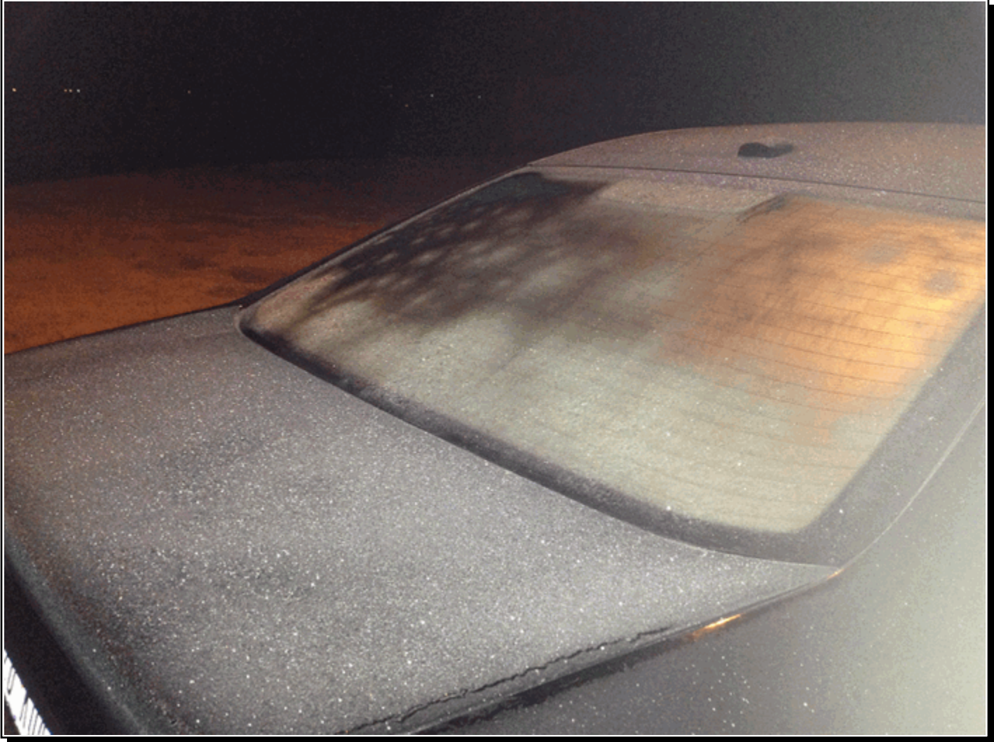
Freezing fog formed ice on vehicles in Gray County. Provided to the NWS Amarillo Facebook page.

Location Date/Time Deaths & Injuries Property & Crop Dmg Event Type and Details