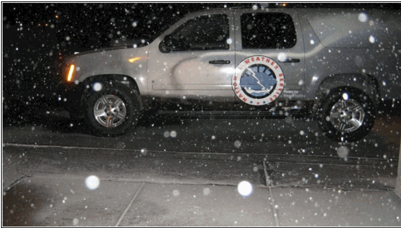
Picture taken by NWS employees showing the snow as it fell at the NWS office in Amarillo, Texas (Randall County). Near one inch of snow was reported at the office.

While snow occurred across the western and southeastern Texas Panhandle, snow accumulations were isolated to the southwestern and south central Texas Panhandle. The highest snow accumulation for this system was 1 inch reported by a trained storm spotter a few miles south of Wildorado (Deaf Smith County). Another trained storm spotter reported 8 tenths of an inch of snow in Adrian (Oldham County), and the State Trooper Station in Vega (Oldham County), approximately 14 miles to the east of Adrian, reported 3 tenths of an inch. The National Weather Service Office in Amarillo (Potter County) recorded 2 tenths of an inch of snow with this system and reports from around town reflected this same amount. Several traffic accidents were reported in Amarillo due to vehicles encountering icy patches on roadways and sliding off the road. No injuries or fatalities were reported in association to this system.