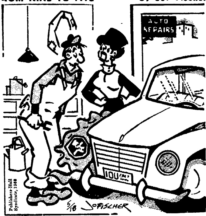
"It's my boss' car. Maybe you'd better take the fender off altogether... so he won't know."