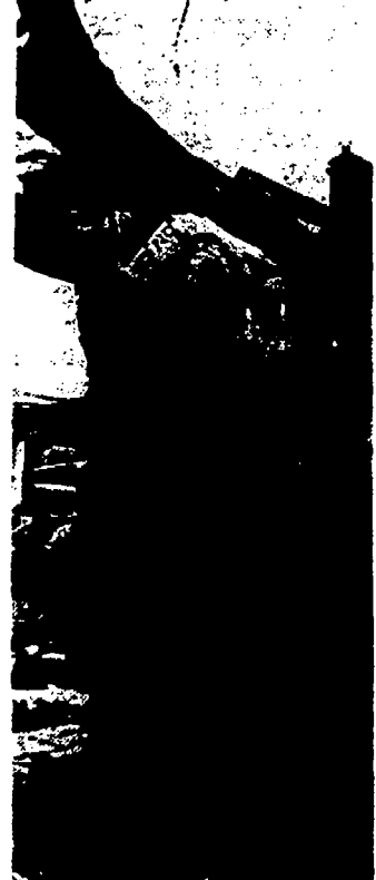
TIME and temperature sign on the First National bank of Oelwein was frozen at zero as a result of the