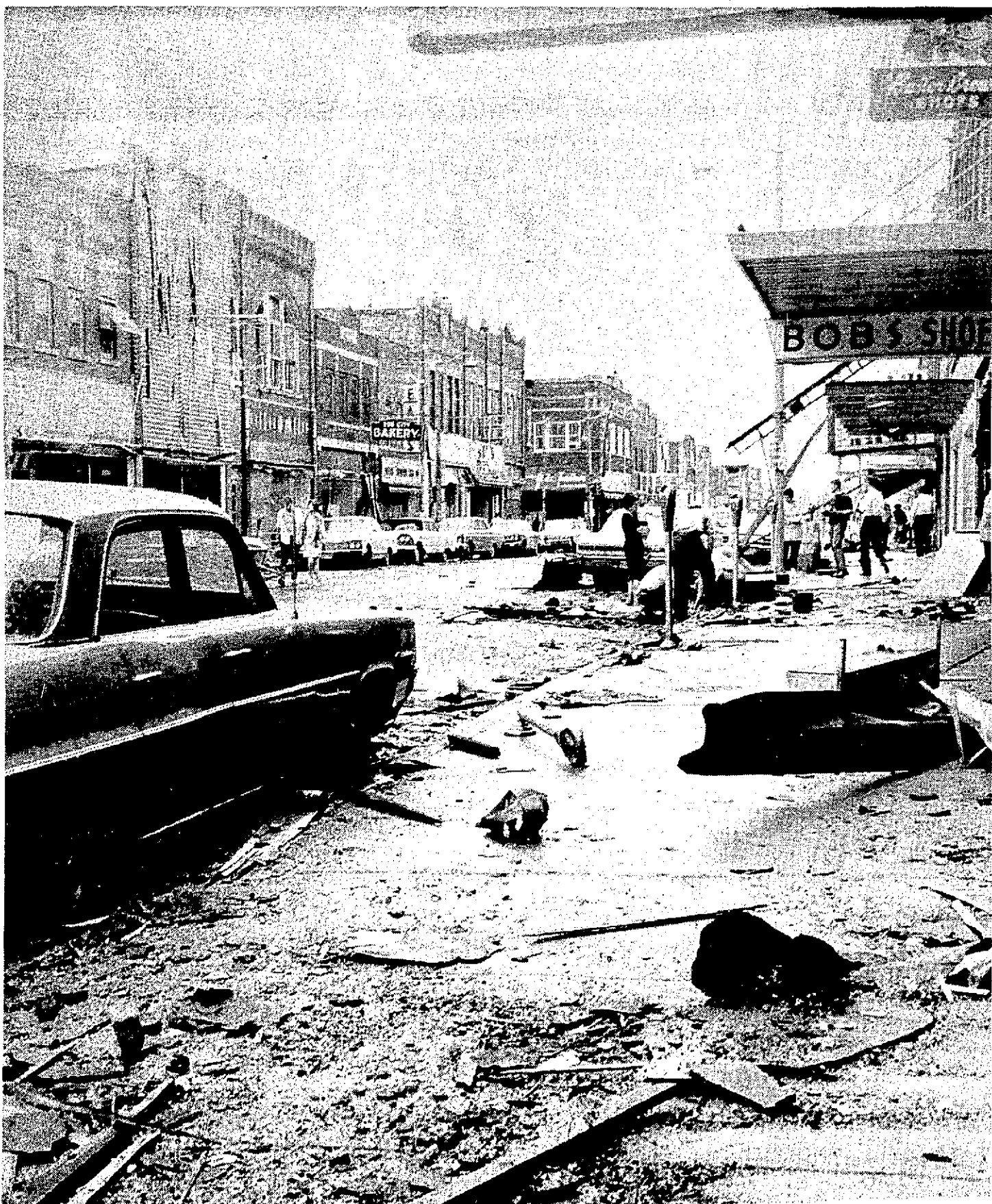
MAIN STREET in Oelwein was littered with broken glass, roofing material, signs and equipment following the storm. One city

official estimated every business establishment in the community suffered damage of one sort or the other.