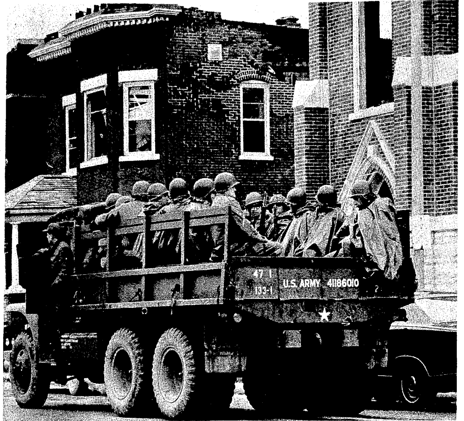
TRUCK LOADS of the Iowa National Guard were called into the city by local and county officials to assist in the problem of traffic and sight-seers. Guardsmen were on duty all night and throughout the day Thursday as clean-up began following Wednesday's storm.