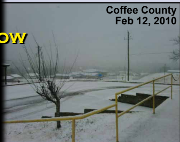
Coffee County Feb 12, 2010

Walker County, Jan 17, 2013