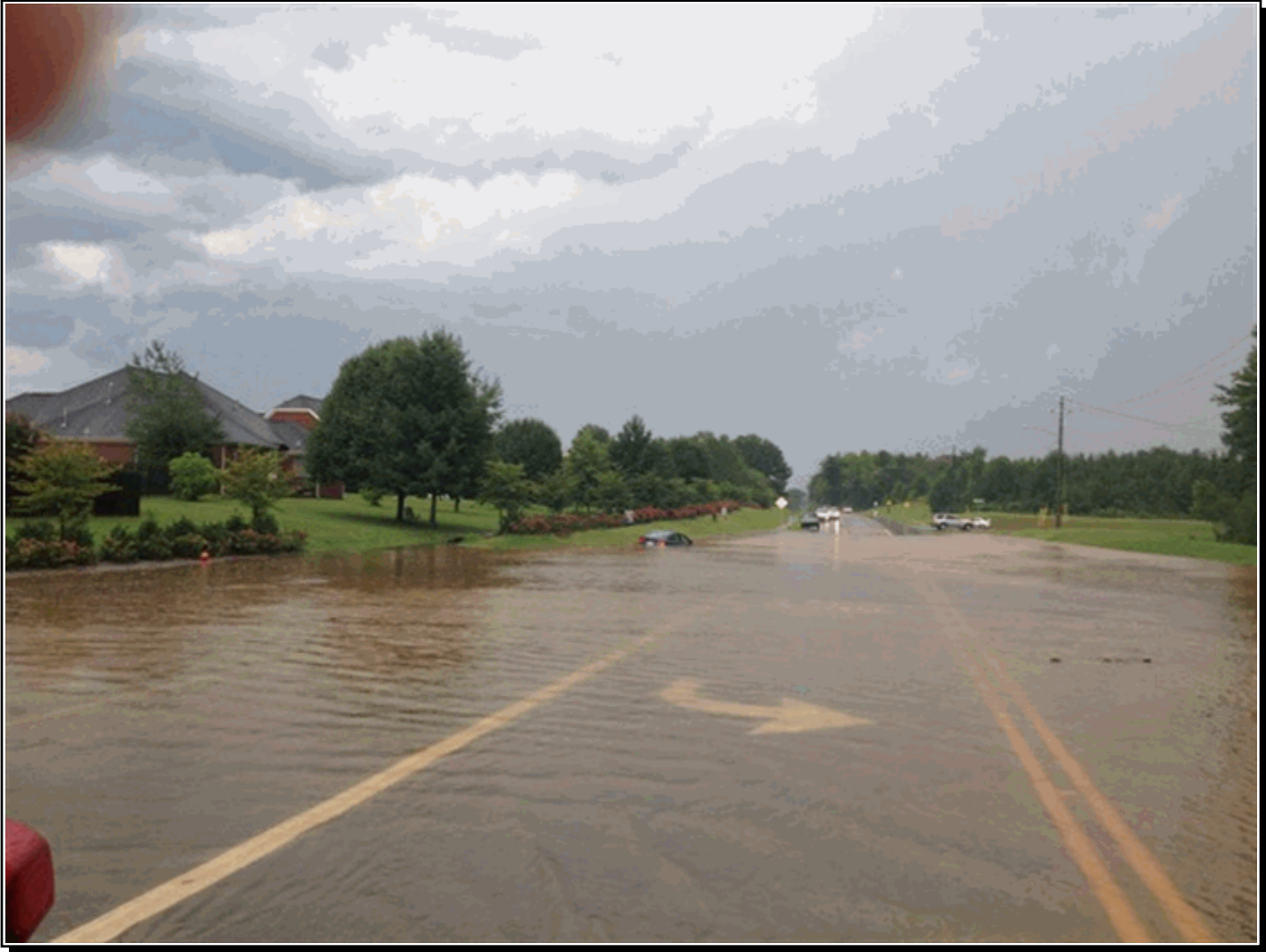
Near intersection of County Line Road and Brownsferry/Gillespie Road (Madison/Limestone county line)

Location Date/Time Deaths & Injuries Property & Crop Dmg Event Type and Details