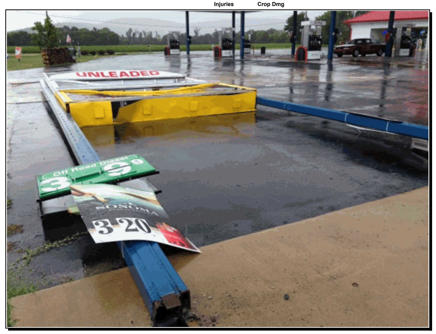
Thunderstorm winds knocked a large sign down at the Jet Pep gas station in Owens Crossroads.

Location Date/Time Deaths & Property & Event Type and Details Injuries Crop Dmg