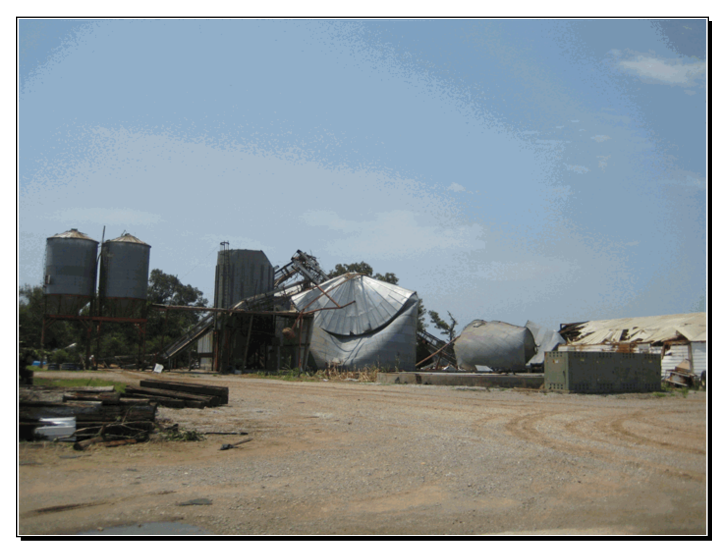
Grain silos crushed by microburst winds outside of Moulton.

Location Date/Time Deaths & Property & Event Type and Details Injuries Crop Dmg