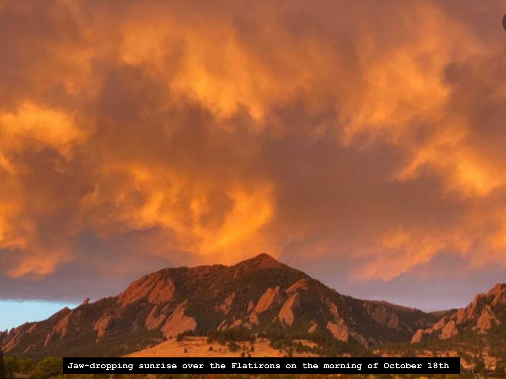
Jaw-dropping sunrise over the Flatirons on the morning of October 18th