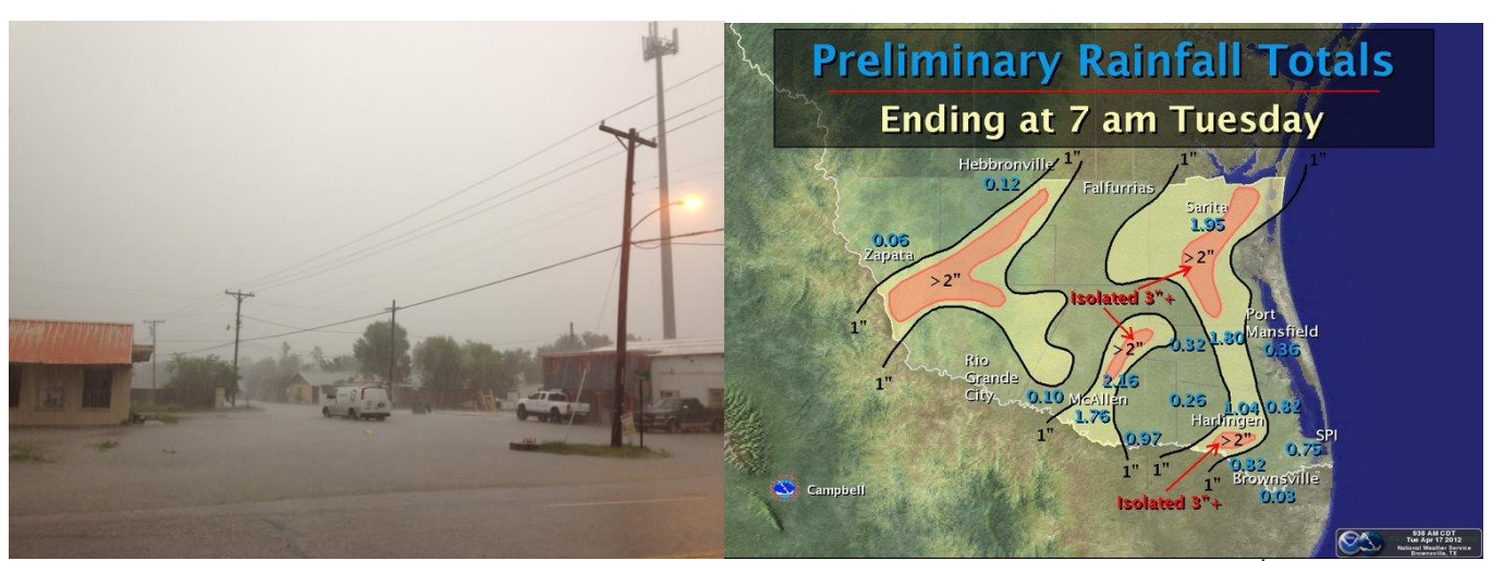
Left: Photograph of classic "urban flooding" in Rio Hondo during the late afternoon of April 16<sup>th</sup>. Right: Preliminary rainfall totals across the Rio Grande Valley and Deep South Texas. The wide variation is common during most thunderstorm episodes in the spring and summer.