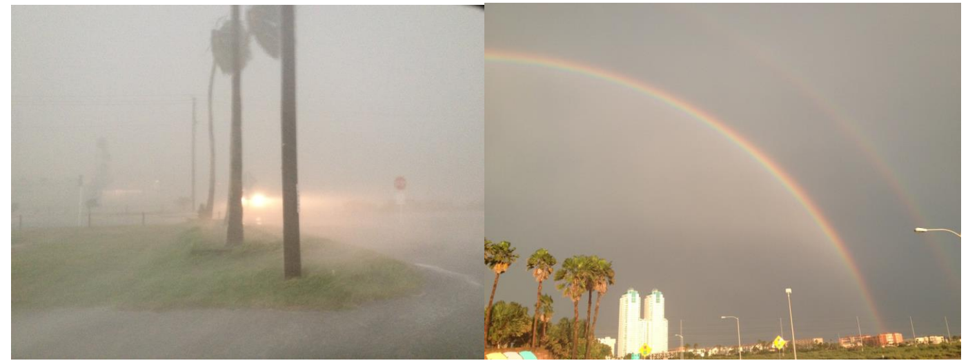
The Beast (microburst, South Padre Island)...