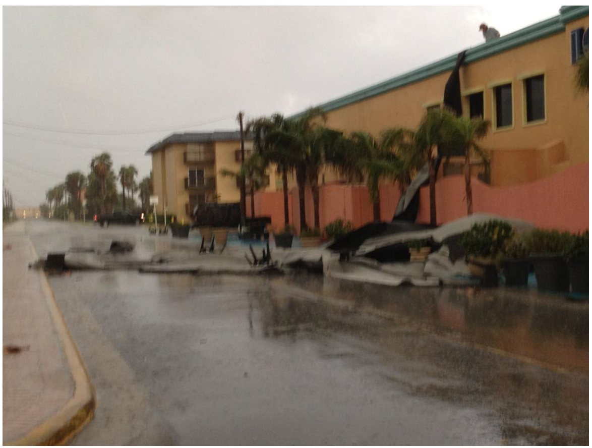
Above: Roofing blown off building associated with Louie's Backyard Restaurant north of the Causeway on the bayside, South Padre Island.