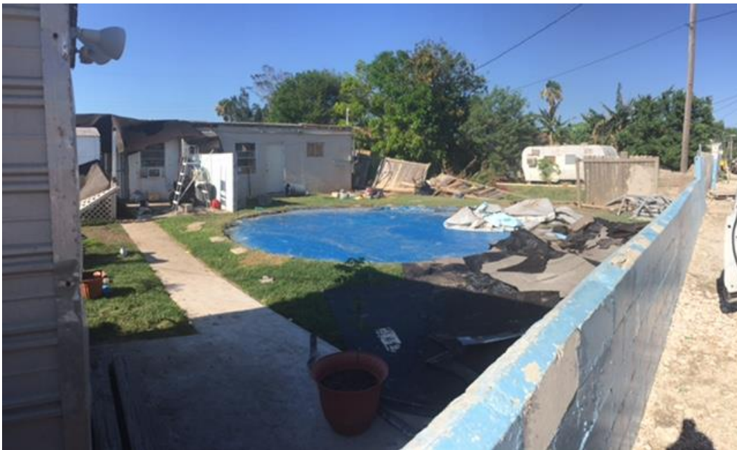
Above, top: One of many impressive shelf clouds, east of Brownsville, associated with scattered strong to severe wind/hail storms June 5, 2017. For more cool clouds from our Facebook page, click here . Bottom: Damage to poorly fastened roof and fence in Laguna Heights from one of the storms which produced winds estimated and measured near 60 mph.