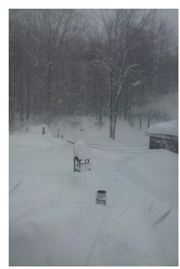
Observing site in Perrysburg, NY, with a standard rain gauge in foreground.

In September of 1994, Lori moved from West Seneca, NY to Perrysburg, NY, in northwestern Cattaraugus County. Growing up in the Buffalo Southtowns, she was used to around 100 inches of snow in a winter. When she moved to Perrysburg, Lori was shocked to find out the annual snowfall was more than double what she was used to! From her location in Perrysburg, quite often there is a significant drop-off in the amount of snow farther down the hill and to the north, and people even on the same road a few miles away may have just a fraction of the snow that Mrs. Dankert receives. The topography really