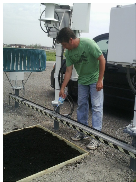
tains a vegetation box that is needed under the temperature and dew point sensors.

I joined the Air Force in the late 80s. My job was NAVAIDS/METNAV. Which translates to what ever ground electronics aircraft used to land, I had to work on. TACAN, ILS, VOR, weather sensors, ground to air radios, and NEXRAD. My tech school was 10 months long. 5 days a week, 8 hours a day we went to school. We learned basic electronics for the first 3 months, then the next 7 months was dedicated to equipment systems. Funny thing is, most Tony Allen, Electronic Technician mainof the stuff we learned in tech school, we never used in the field. When we got into the field we learned how to maintain the equipment. Tech school taught us how the systems worked electronically, in the field we learned how to repair it when it broke. I served 24 years active duty.