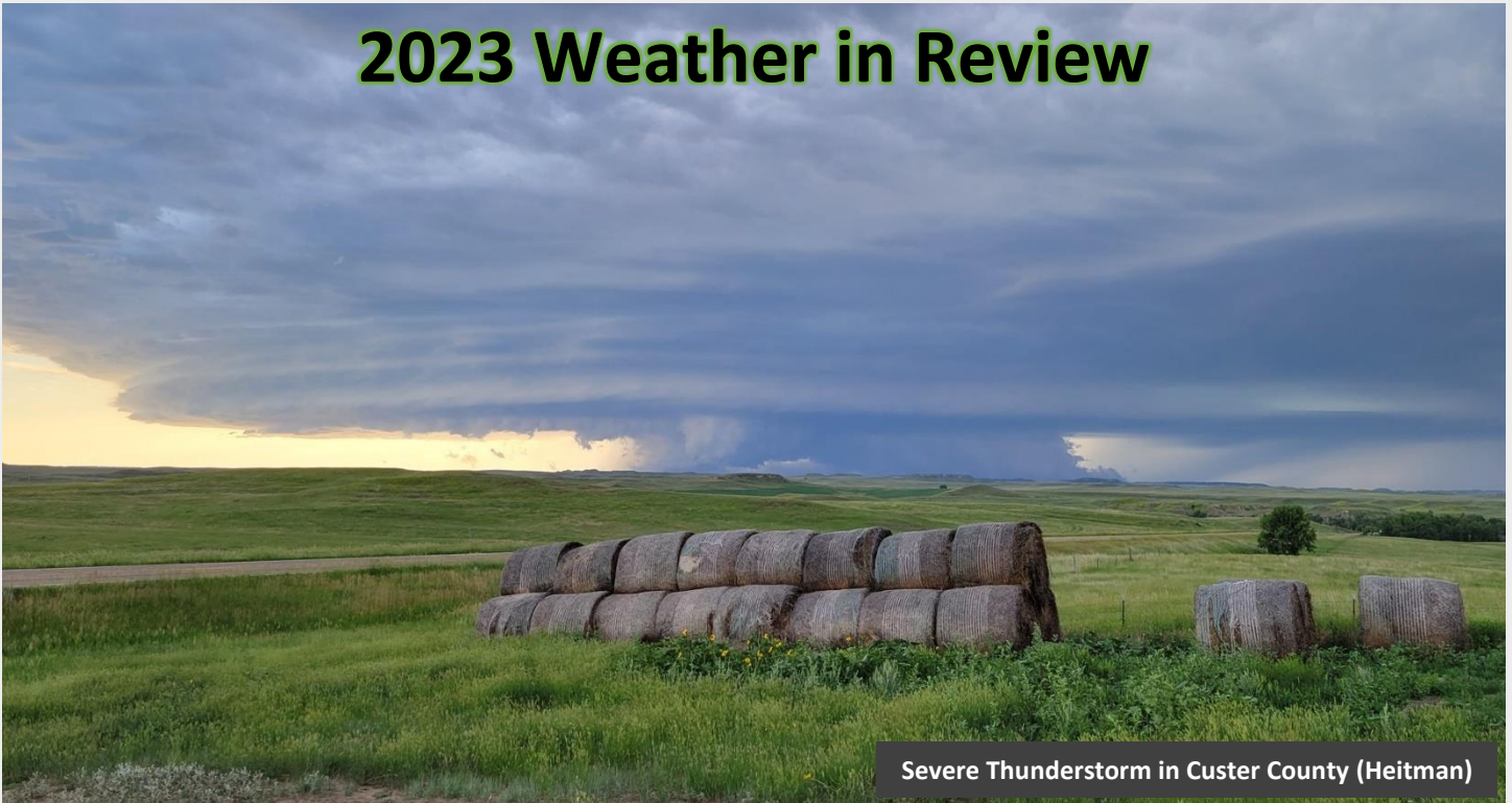
Severe Thunderstorm in Custer County

The following is a weather review for the Billings forecast area, which includes southeast Montana, parts of south-central Montana, and Sheridan County in Wyoming. This summary is current as of December 13 th and will be updated for the final statistics and any additional weather events at the end of the year.