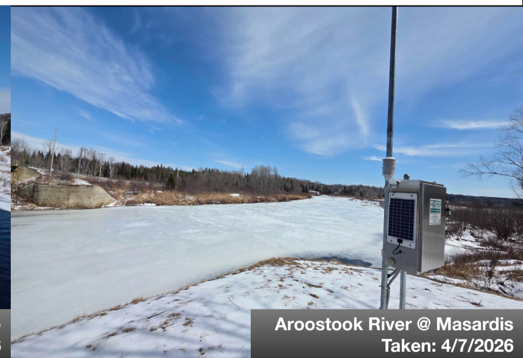
Aroostook River @ Masardis Taken: 4/7/2026