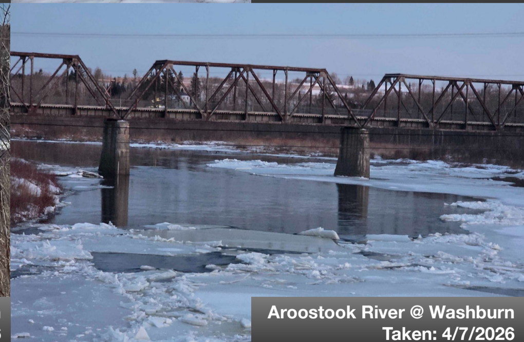
Aroostook River @ Washburn Taken: 4/7/2026