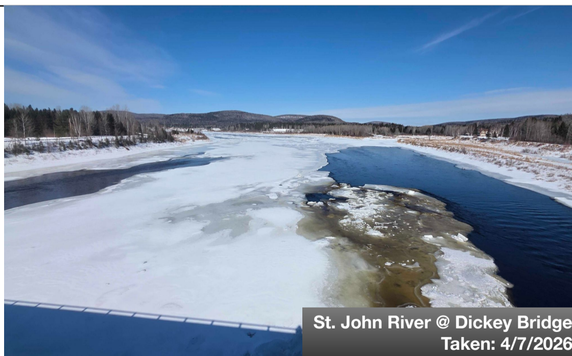
St. John River @ Dickey Bridge Taken: 4/7/2026