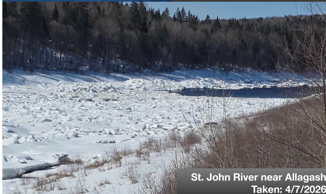
St. John River near Allagash Taken: 4/7/2026