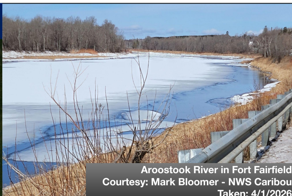
Aroostook River in Fort Fairfield Taken: 4/1/2026