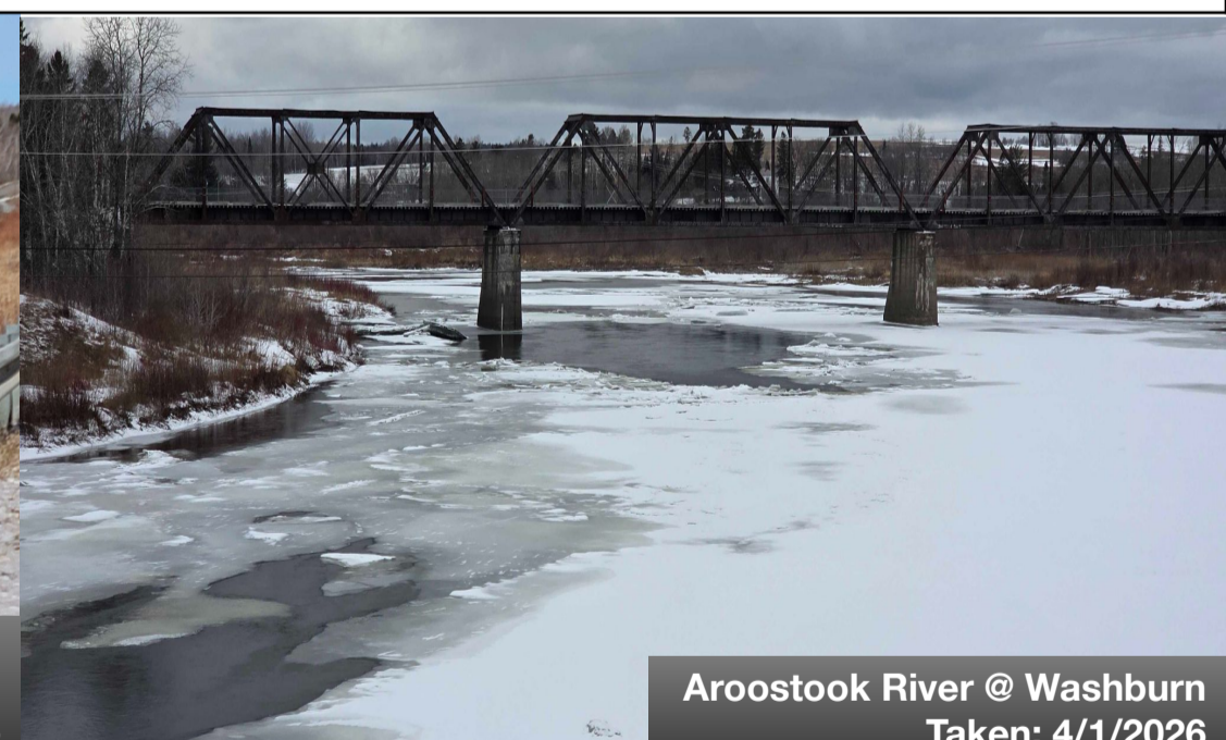
Aroostook River @ Washburn Taken: 4/1/2026