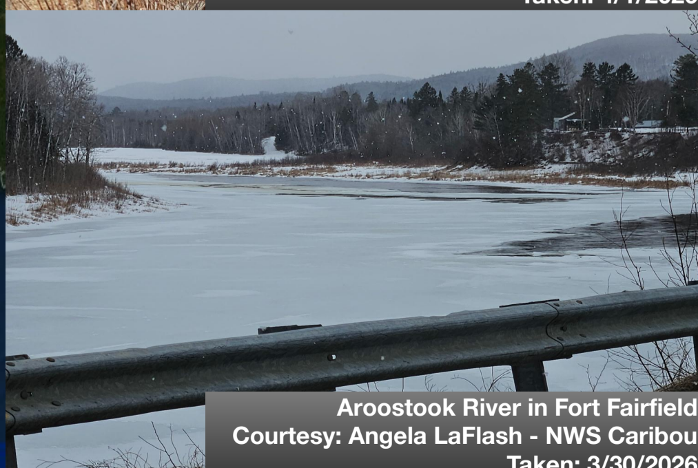
Aroostook River in Fort Fairfield Taken: 3/30/2026