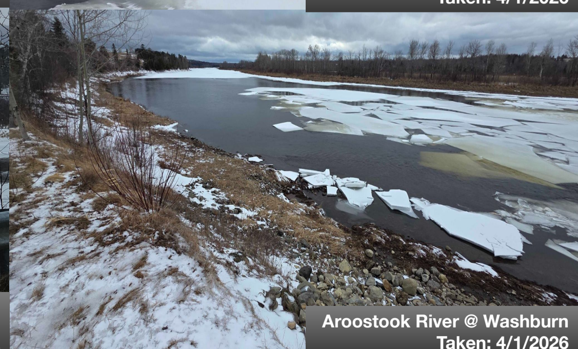
Aroostook River @ Washburn Taken: 4/1/2026