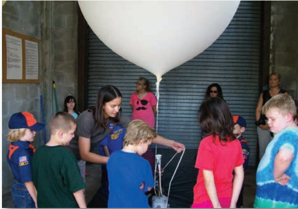
NOAA meteorologist teaches elementary school children about weather observation

WRN Ambassadors are change agents and leaders of their communities. You will inspire others to be better informed and prepared – helping to minimize or even avoid the impacts of natural disasters.