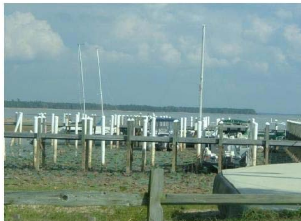
Lake Marion, 10-07