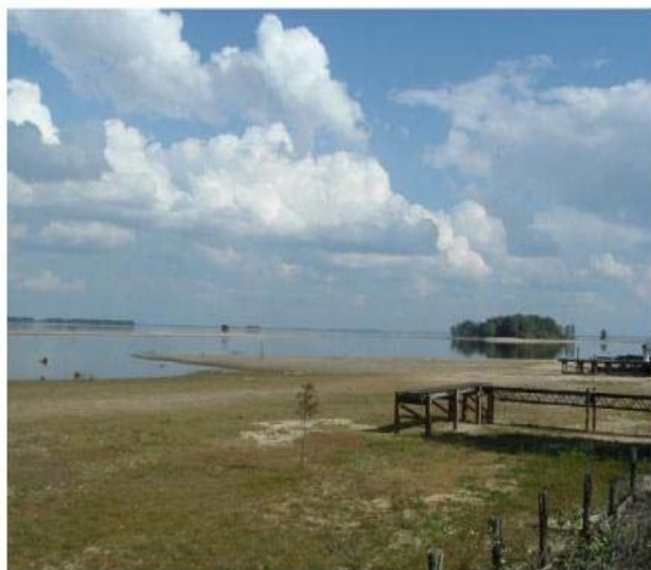
Lake Moultrie, 10-07

The lack of rainfall resulted in very low water levels on area lakes as well. Here is a look at some effects of the extremely dry conditions in 2007.