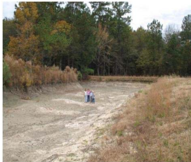
Dry Pond in Dorchester County, 11-07