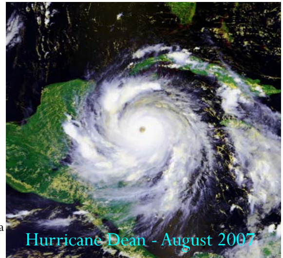
Hurricane Dean - August 2007

Although the official Atlantic hurricane season runs from June 1 to November 30, tropical and subtropical storms can form any time of year. In fact, Subtropical Storm Andrea developed in May while Subtropical Storm Olga developed in December, and later became a tropical storm. Subtropical Storm Andrea developed east of Jacksonville, Florida on May 9. The main impacts to southern South Carolina and southeast Georgia were along the coast, including higher than normal tides, high surf and gusty winds around 40 mph. The only other systems to affect our area were the remnants of Tropical Storm Barry and Tropical Storm Gabrielle. Tropical Storm Barry weakened into a tropical depression just before making landfall in the Tampa Bay area of Florida and then became an extra (non)-tropical low over eastern Georgia on June 3. The system intensified and moved up the U.S. East Coast bringing 2-6 inches of rain, gusty winds near 50 mph and higher than normal tides to the area. Tropical Storm Gabrielle developed from an extra-tropical low between Bermuda and North Carolina on September 8 before moving northwest and then north and making landfall along the Cape Lookout National Seashore in North Carolina on September 9. The main impact to Charleston's County Warning Area was increased seas in the form of swells.