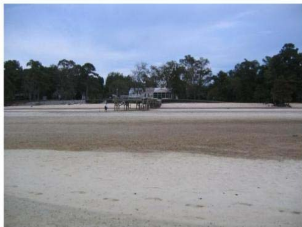
Lake Marion, 10-07