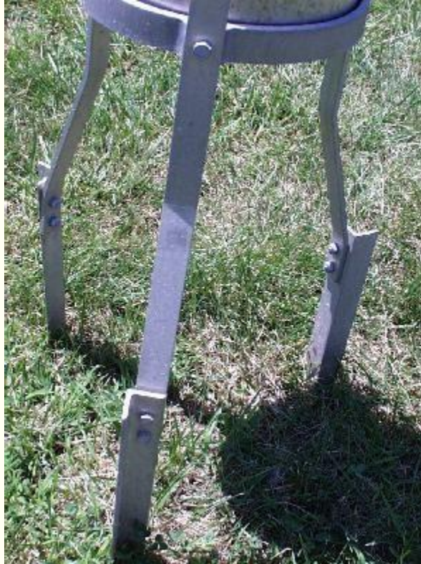
Typical Gage Support

relative to the support can be easily accomplished with a hammer. Once the SRG support is completely installed, the SRG should be inserted into the support and leveled. This is accomplished by gently driving in the appropriate stake(s) to attain a level posture for the 8 inch opening of the SRG.