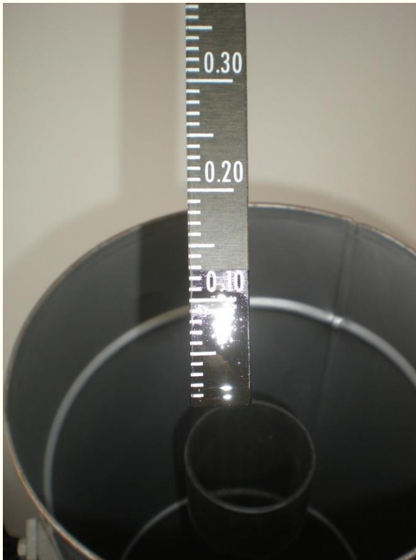
Observation Taken with Measuring Stick

If the rainfall is greater than the measuring tube capacity, water will overflow into the overflow can. The measuring stick should not be used directly in the overflow can. Instead, water from the overflow can should be poured into an empty measuring tube for measurement with the stick.