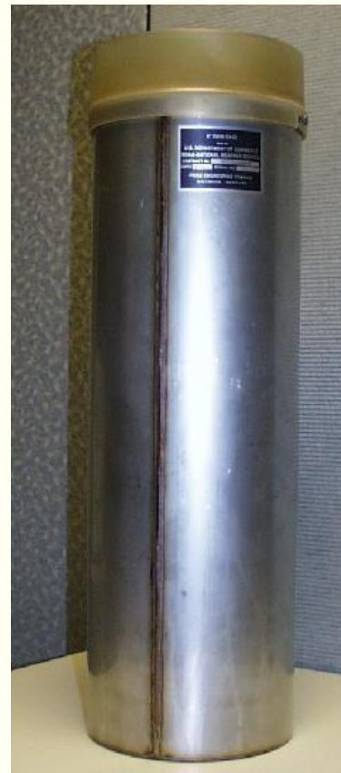
SRG Overflow Can