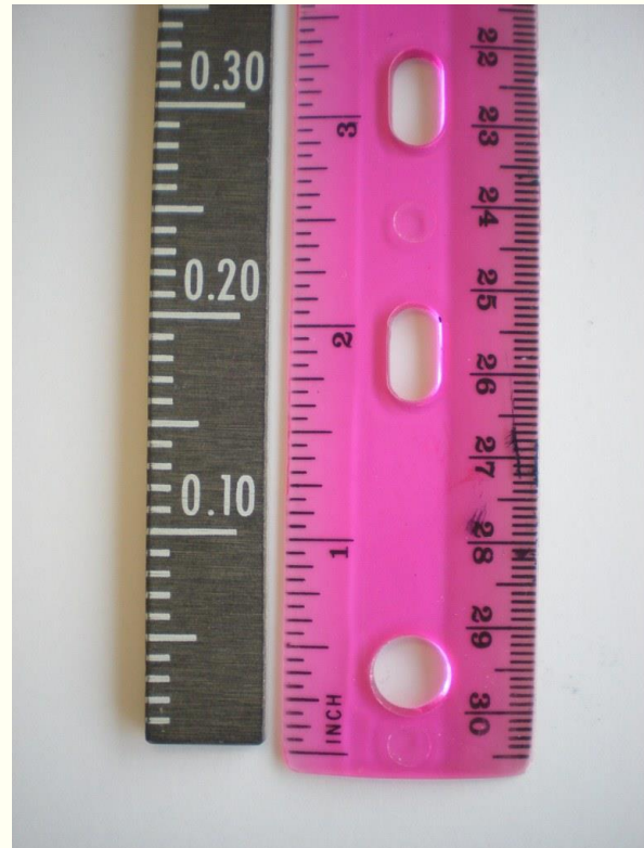
Measuring Stick is Calibrated 10:1