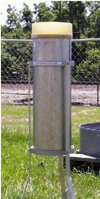
Standard Rain Gauge (SRG)

The overflow can of the Standard Rain Gage collects water when rainfall greater than 2.00 inches occurs during the observation period and overflows the measuring tube. The maximum capacity of the overflow can is 20 inches.