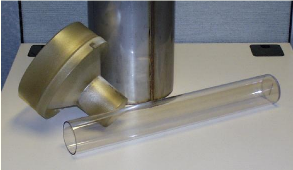
Collector Funnel and Measuring Tube

hammer can be used to remove dents so it will fit over the can. Also, fiberglass collector funnels are easily cracked or broken, if dropped.