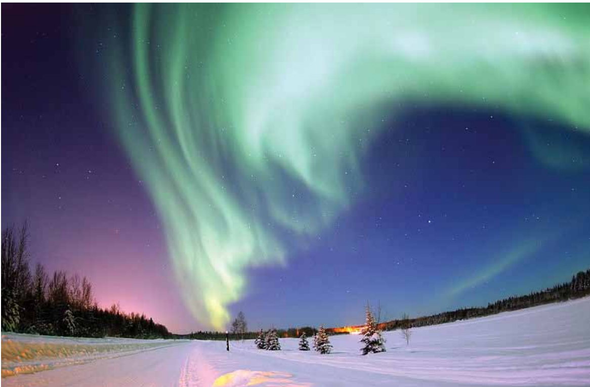
Example of Aurora Borealis or Northern Lights.

Meteorologists speculated on the importance of the Aurora to weather, theorizing the Aurora was the result of atmospheric electricity, and like lightning, must occur with certain types of weather.