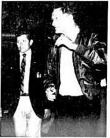
Governor on the scene: Ont. Gov. Robert F. Gibbons arrived Friday night to inspect the havoc created in many Simcoe County areas by the tornadoes. He stated several disaster headquarters, and promised all possible help from the state. It was nearly 2 a.m. when the governor, still weary from a busy day, flew back to Cobourg.