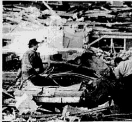
Debris scattered throughout Columbiana County and western Pennsylvania Friday evening. A tornado leveled the town, the wreckage from the storm was scattered everywhere.