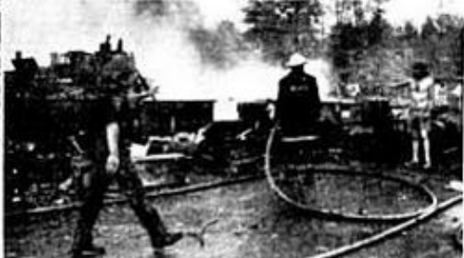
Early damage: Mississauga, one of the first Simcoe County areas to be hit by a tornado, had its share of extensive damage but no loss of life. Police and firemen were on the scene where a fire broke out, apparently from electrical causes, in the wake of the tractor which trashed down before it hit.