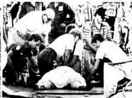
Ruile efforts: Paramedics worked heroically to revive a woman who was buried beneath heavy beams of the Post Park Plaza but their efforts were in vain.