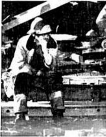
Exhausted: A Mississauga woman, exhausted from search efforts and disappointed over the loss of her 10-year-old son, sits on a bench before leaving the search for bodies in what once was a park in the Park Plaza area and the adjacent shopping centre.