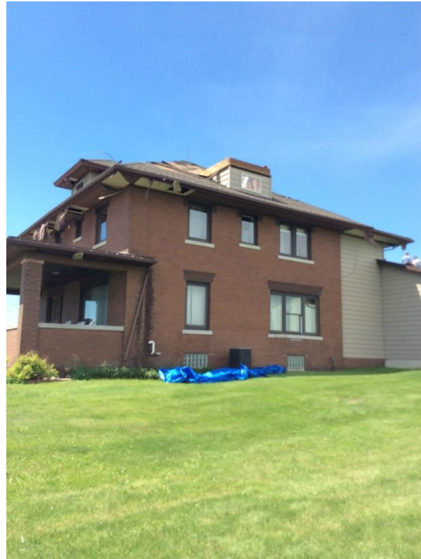
Two houses early in the tornado's track sustained roof damage.