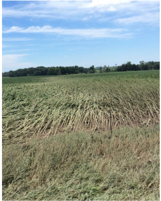
Damage was primarily to crops and trees. The tornado produced impressive ground scouring.