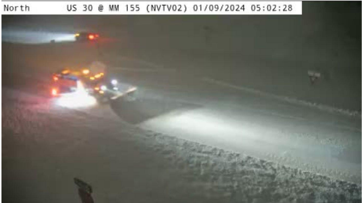
IDOT webcam along Highway 30 between Ames & Nevada (top, Tue Jan 9 5:02am)