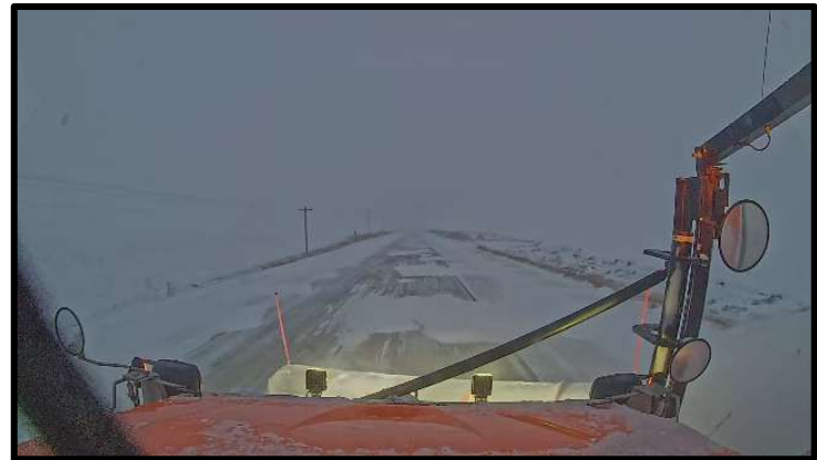
Iowa DOT plow cam north of Pocahontas on Highway 4 around 5pm Saturday, November 29, 2025.