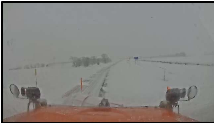
Iowa DOT plow cam east of Fort Dodge on Highway 20 around 8:20am Saturday, November 29, 2025.