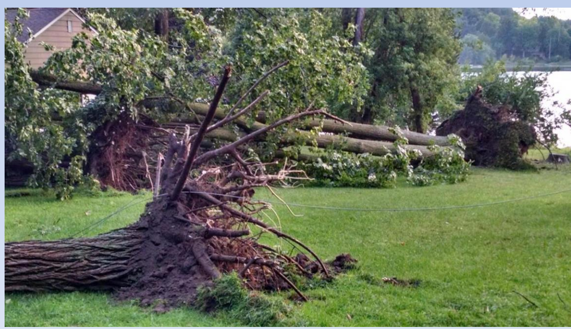
Pictures from NW Lenawee County, Killarney Highway just south of US-12 from a home on Allen Lake. Time was between 5:20 and 5:25pm.