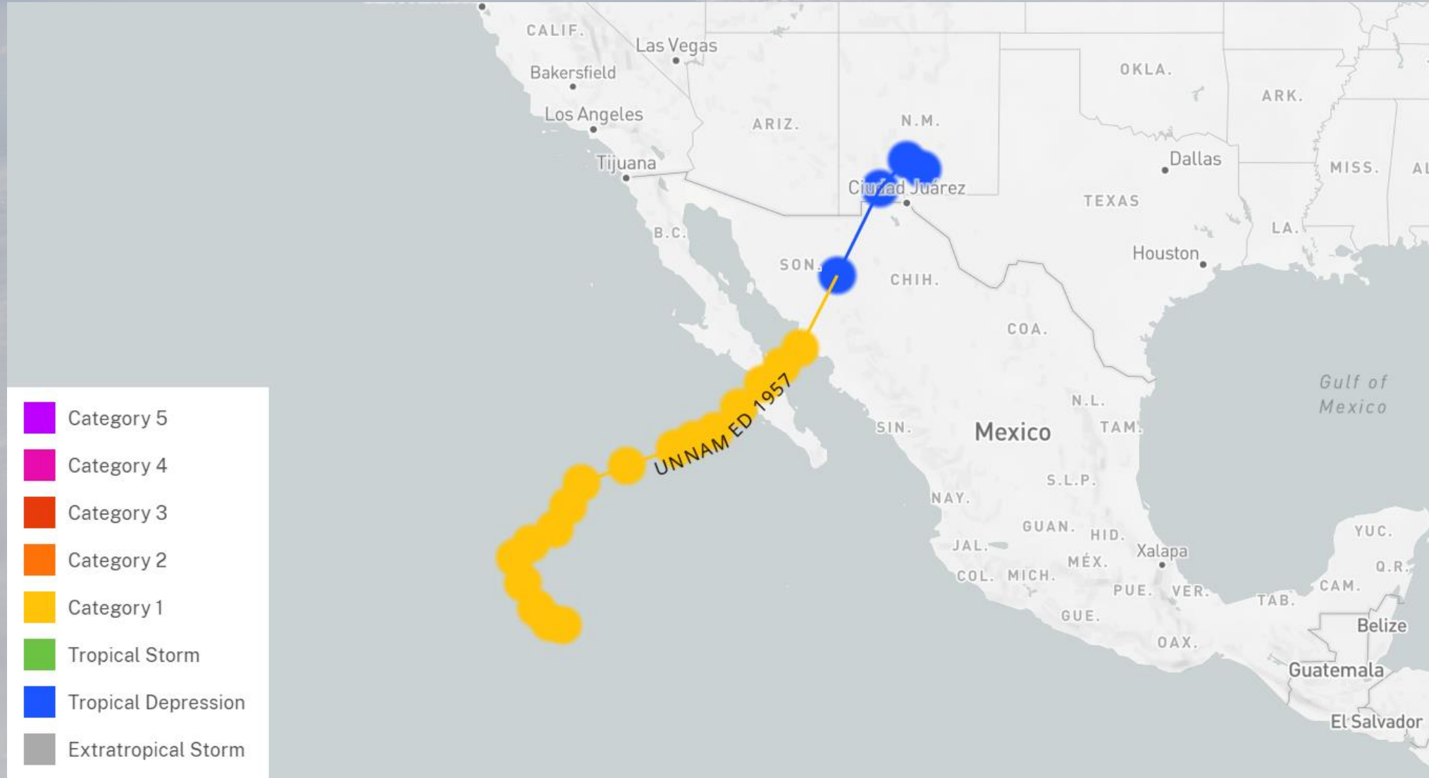
Unnamed 1957 Track

Unnamed 1957 or Hurricane Ten was a tropical cyclone that affected Mexico during the 1957 Eastern Pacific Hurricane season. It made landfall over the state of Baja California Sur, Mexico, crossed the Gulf of California and made landfall again over the state of Sonora, Mexico; both times as a Category 1 hurricane. The hurricane weakened as it traveled through the Mexican state of Sonora and Chihuahua. The remnants of this hurricane eventually passed through the El Paso and southern New Mexico region on October 10, 1957