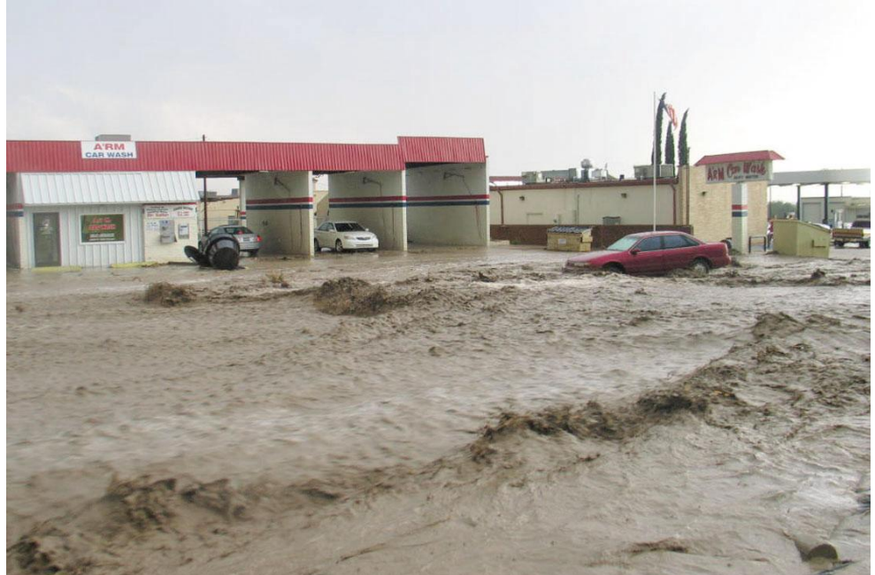
On June 22 torrential downpours severely flood portions of Alamogordo with 10<sup>th</sup> Street becoming a raging river.