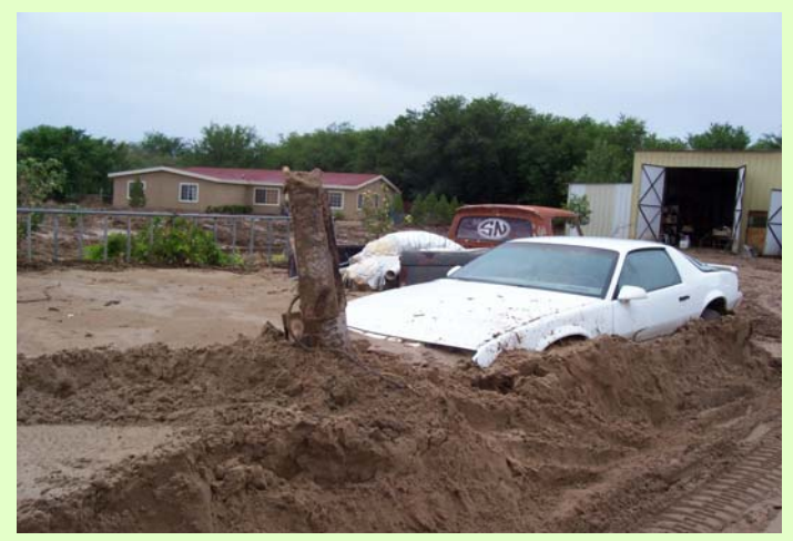
Mudslides partially bury a car and truck in Clint during the heavy rains of July 28-29.