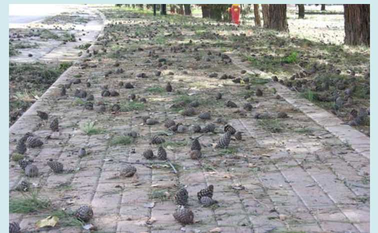
Large hail strips pine cones off of trees in Las Cruces.