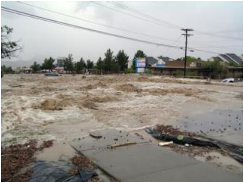
On Aug 1 2006 torrential rains produce widespread flash flooding and major damage across El Paso including the Shadow Mountain area above.

The good news is no deaths or serious injuries were reported from the floods.