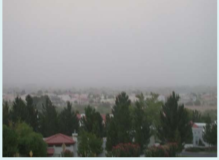
Blowing dust and low visibilities occur over Santa Teresa and west El Paso when strong thunderstorm winds blow across the area on June 22.