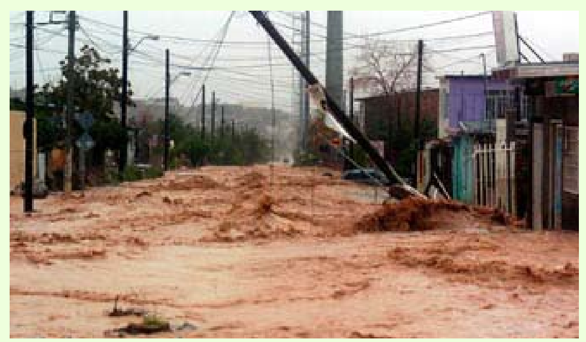
Torrential August 1 rains also flood and seriously damage much of Jaurez Mexico.