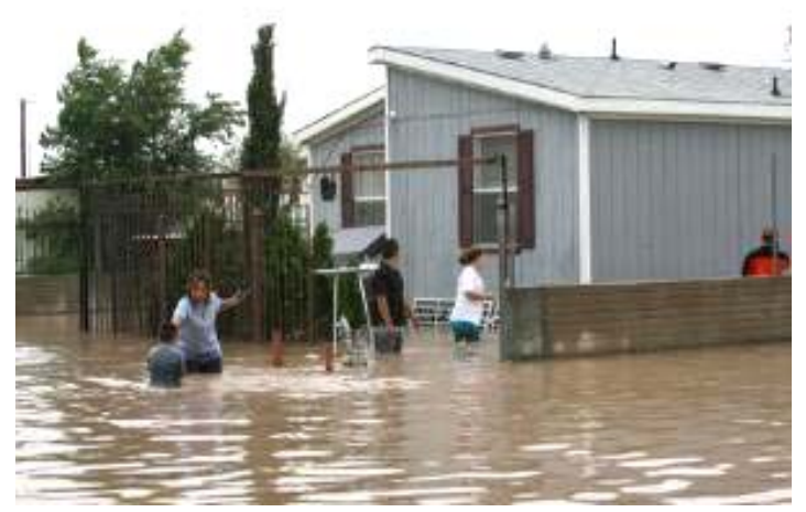
August 1 flooding destroys or damages much of Canutillo.