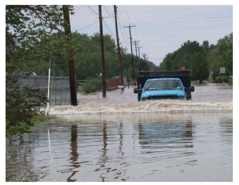
Mulberry Street in west El Paso.

August 12: Hudspeth County thunderstorms produce two inches of rain in an hour and small hail causing street flooding around Dell City.