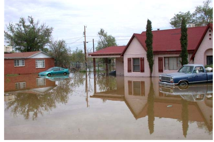
Emory Road in west El Paso.