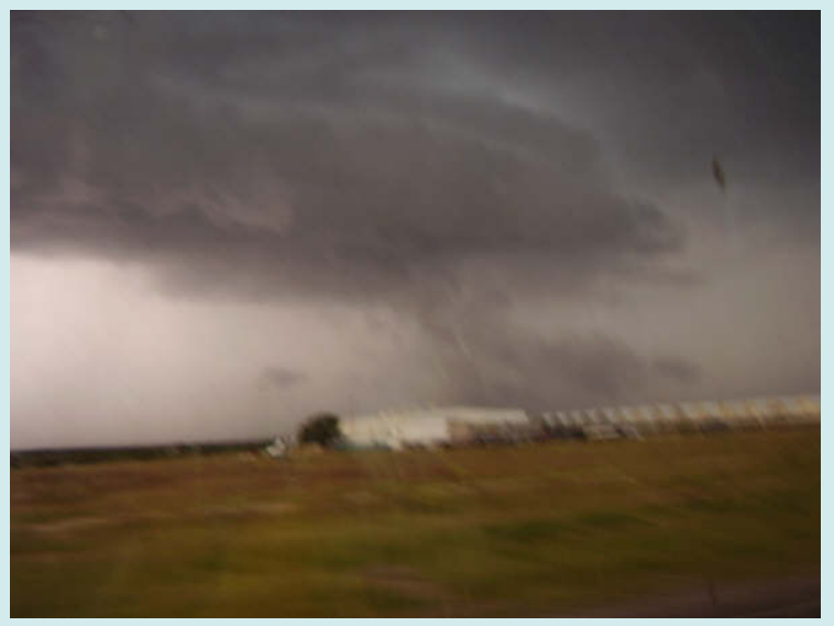
Tornado over western portions of Las Cruces.