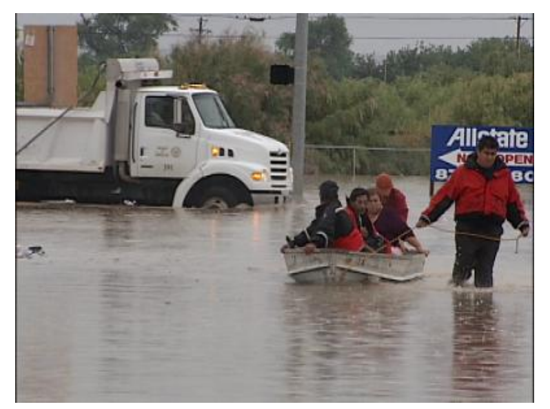
Water rescue in Canutillo

evacuate Vinton residents to higher ground. Extensive flooding also damages or destroys much of Canutillo where high waters inundate homes and close roads. The floods will make portions of Canutillo declared permanently uninhabitable by public safety officials.