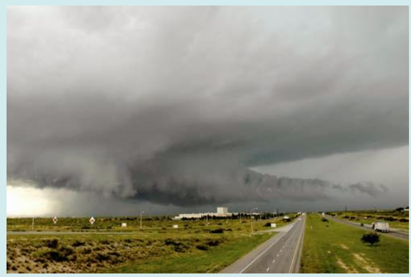
On September 13 this high precipitation supercell thunderstorm moves into the Las Cruces area producing a tornado and large hail.

The September 13 supercell thunderstorm also drops torrential rainfalls over the Las Cruces vicinity with flooding around New Mexico State University.