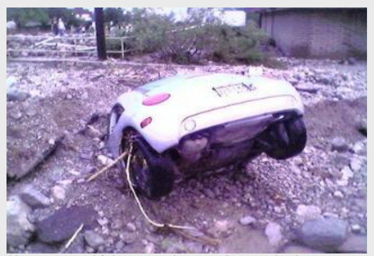
Numerous vehicles are submerged or washed away by floodwaters over west El Paso and surrounding communities.