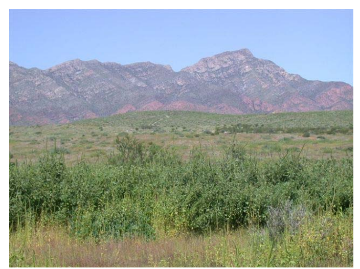
West El Paso along Franklin Mountains.

From July to September 2006 EI Paso International Airport measures 15.01 inches of rain making the 2006 monsoon officially the wettest on record. In addition a few public or cooperative observers measure over thirty inches of rain around the borderland as much of the southwestern United States including western Texas, New Mexico and Arizona experience record rainfalls. The wet weather brings extremely dense vegetation growth with the once barren sands covered by flowers and an abundance of green plants.