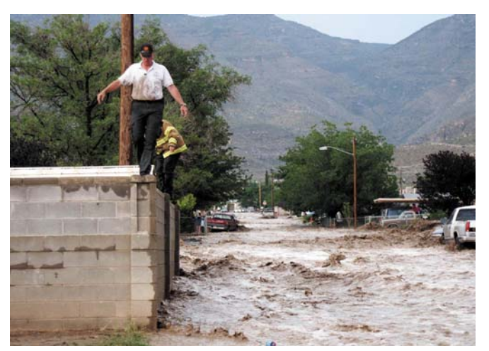
Abbott Street and Boyce Avenue in Alamogordo after the June 22 heavy rains.

June 22: Thunderstorms dump up to four inches of rain over northern Otero County causing major flash flooding across Alamogordo. Rains turn streets into raging rivers with homes and buildings flooding, property and infrastructure damaged and some vehicles being washed away. Water reaches window-level on a few streets forcing evacuations in some neighborhoods. Serious flooding also occurs at Boles Acres and Marble Canyon with total damage estimated at two million dollars.