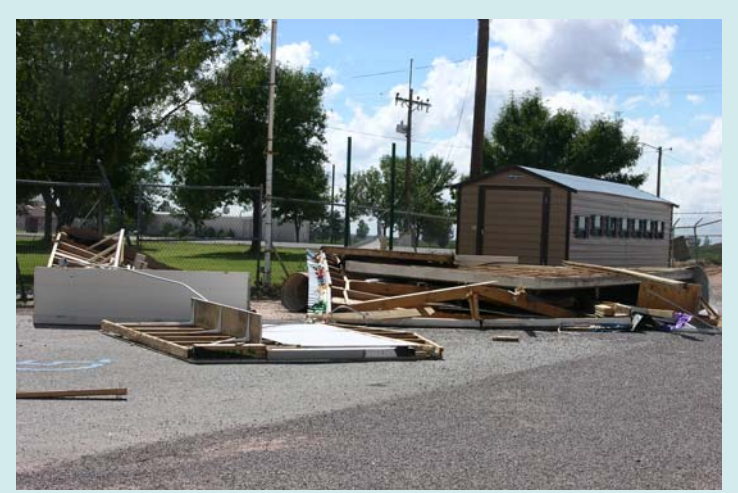
Wind damage at Las Cruces Fairground.