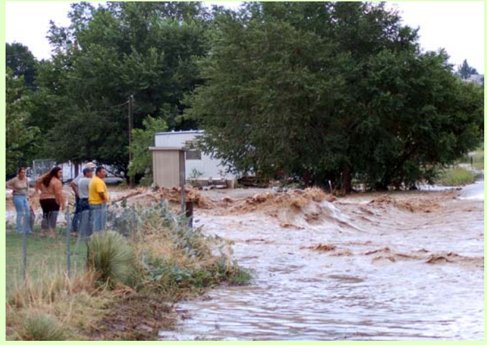
Over three inches of rain fall around Silver City on July 28 flooding the San Vincente area.