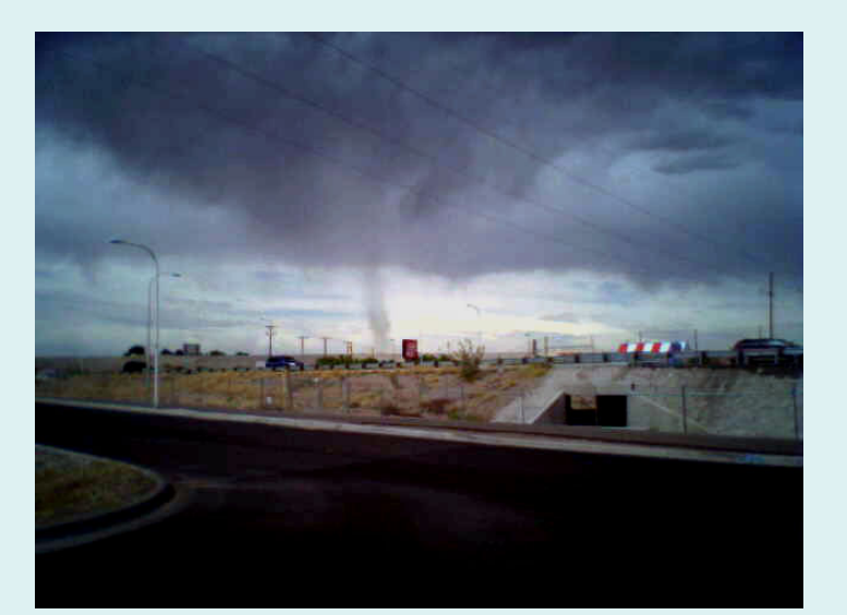
May 19 thunderstorms produce this small tornado near Las Cruces.

July 27: Evening thunderstorms wash out roads around Hueco Tanks, Clint and eastern El Paso. Lightning strikes also cause power outages across El Paso.