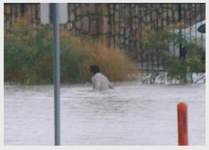
August 1 flooding at Donaphan and Frontera in west El Paso.