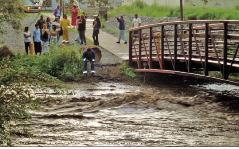
August 10 flooding at Santa Clara.

El Paso police and firefighters evacuate residents from Durazno Avenue after the heavy rains of August 4 flood their neighborhood.