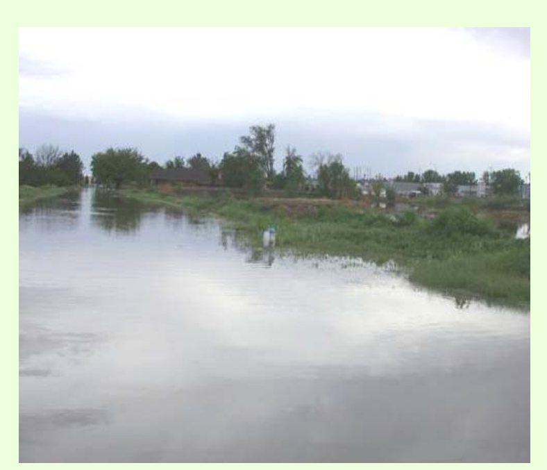
August 19 early morning downpours again flood areas of west El Paso.

August 19: Early morning thunderstorms bring one to two inches of rain around west El Paso, Santa Teresa and Sunland Park with more street flooding and road closures.