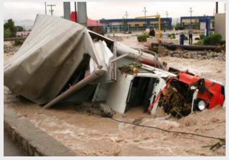
The August 1 2006 deluge severely floods and damages much of west El Paso including the Thunderbird and Mesa area where rushing waters destroy this eighteenwheeler.