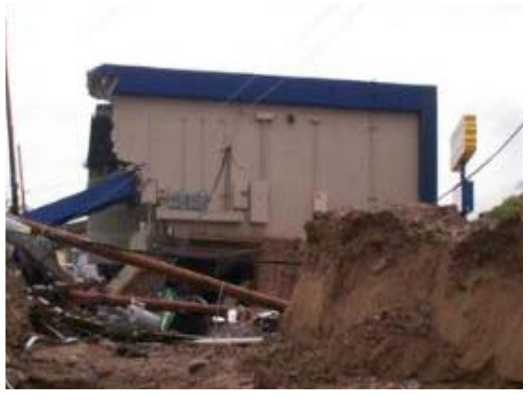
Rapidly moving floodwaters demolish a Blockbuster Video building in west El Paso.