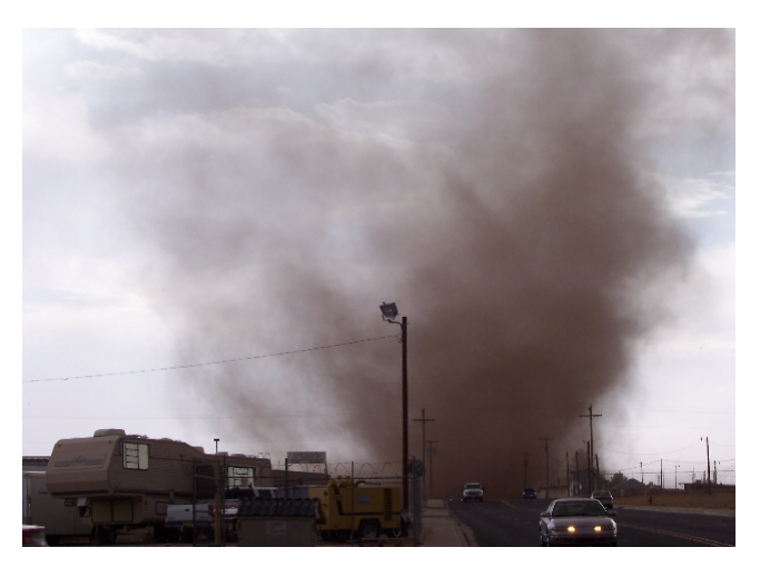
On May 13 this weak tornado moves across Alamogordo.