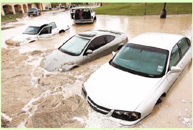
High waters submerge cars in Santa Teresa after the heavy rains of July 31.