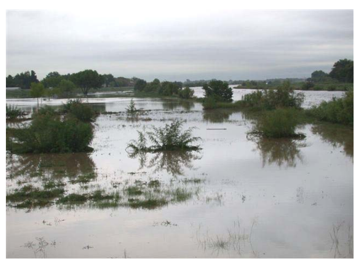
The Rio Grande overflows along Country Club Road in El Paso.