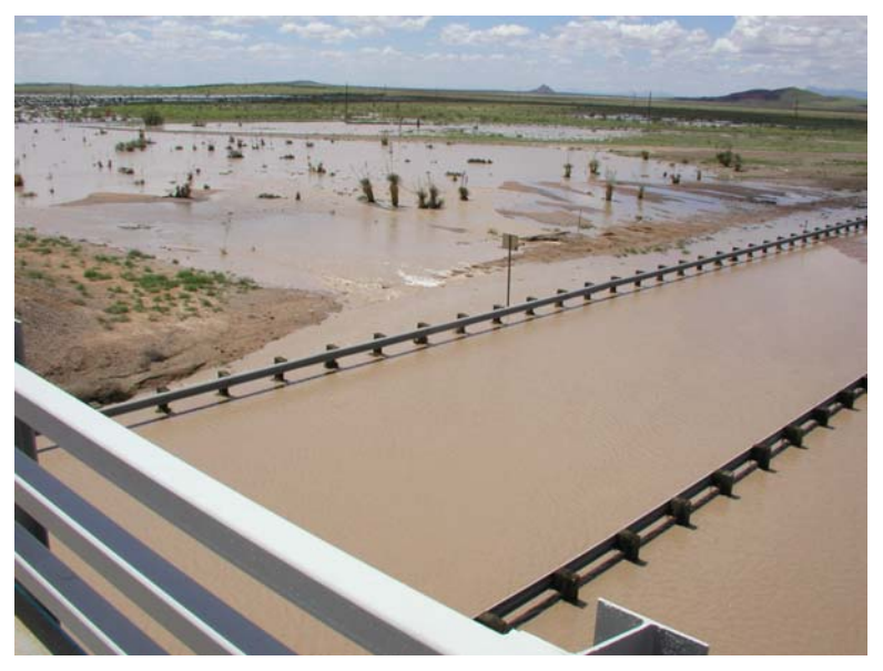
On August 28 Interstate 10 is closed between Las Cruces and Deming after torrential overnight rains flood the highway.

September 1-4: Moisture from Tropical Storm John streams northward into southern New Mexico and western Texas while a surface cold front moves through the region. This weather pattern generates strong thunderstorms September 1<sup>st</sup> with periods of moderate rainfall continuing the next three days. Over southern Dona Ana and El Paso Counties three to eight inches of rain fall in the four day period.