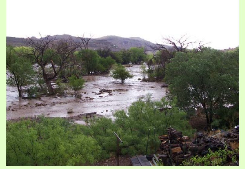
Very heavy rains on July 28 cause the Percha Creek to overflow near Hillsboro.

July 31: Slow moving thunderstorms with more very heavy rains cause widespread flooding across sections of El Paso and Dona Ana Counties. Rockslides and debris shut down Trans Mountain Road through the Franklin Mountains. Street flooding also closes some El Paso roads while water submerges cars in Santa Teresa.