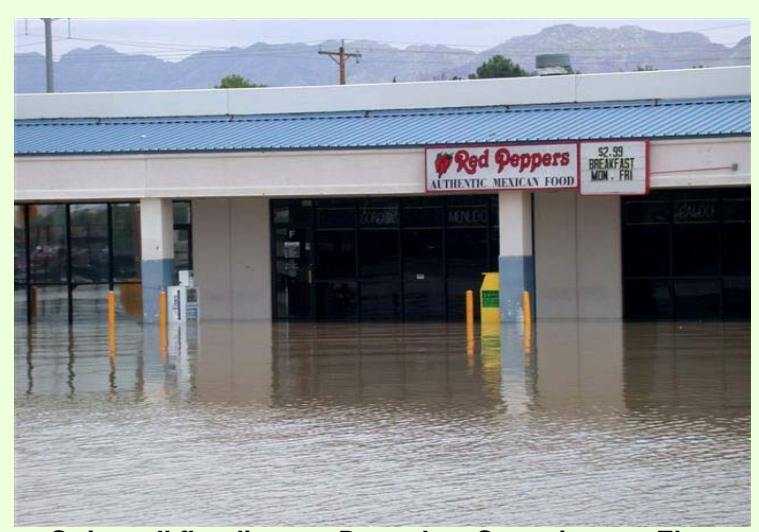
Strip mall flooding on Donaphan Street in west El Paso.

During the late afternoon thunderstorms with torrential rainfalls flood streets and close roads over areas of Las Cruces and the town of Dona Ana. Further west heavy rains flood portions of Grant County around Bayard, Hurley and Santa Clara.