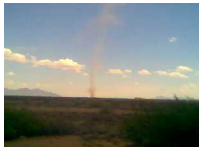
Despite the rain and clouds there are a number of hot dry days in June and early July resulting in early summer dust devil activity.