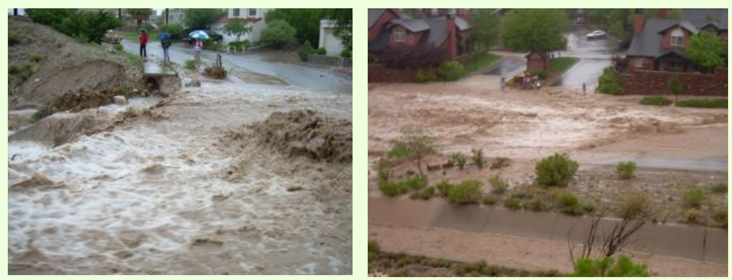
Flooding in the Silver Springs area of El Paso.

August 3: Early morning thunderstorms with heavy rains rumble through El Paso and Dona Ana counties with one to two inches of rain falling within two hours. As a result more flooding occurs around El Paso, Santa Teresa and Sunland Park. High waters pour into several homes and businesses over sections of El Paso with the flooding around a four block area of Saipan and Reynolds Streets especially severe. Numerous roads are again closed including Interstate 10. Flooding also occurs across much of west El Paso.