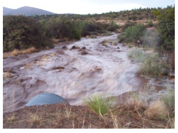
An arroyo floods near Silver City during the heavy rains of May 15.