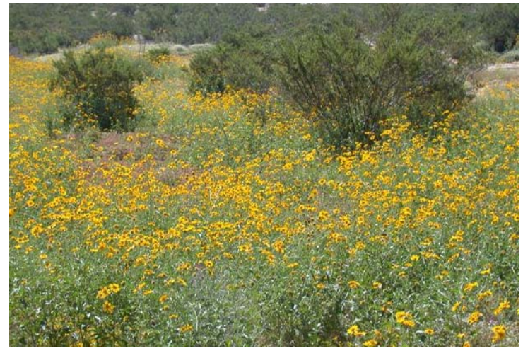
Wildflowers in bloom over Santa Teresa.