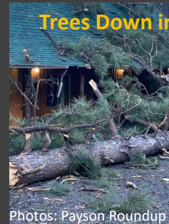
Trees Down in Christopher Creek

The new year started off very cold with sub-freezing highs and below-zero lows over the high country on the 1 st and 2 nd , along with some light snow. The remainder of the month saw temperatures near normal. Very little precipitation fell, with much below normal monthly totals. The weather pattern was favorable for gusty northeast winds at times, including on the night of the 27 th when damaging wind occurred just south of the Mogollon Rim including Pine and Christopher Creek. Widespread power outages were reported in this area.