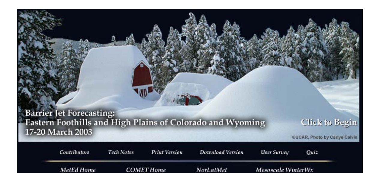
Figure 2. COMET learning module for Barrier Jet Forecasting. One of the prerequisite readings for students in the Mountain Weather Course.