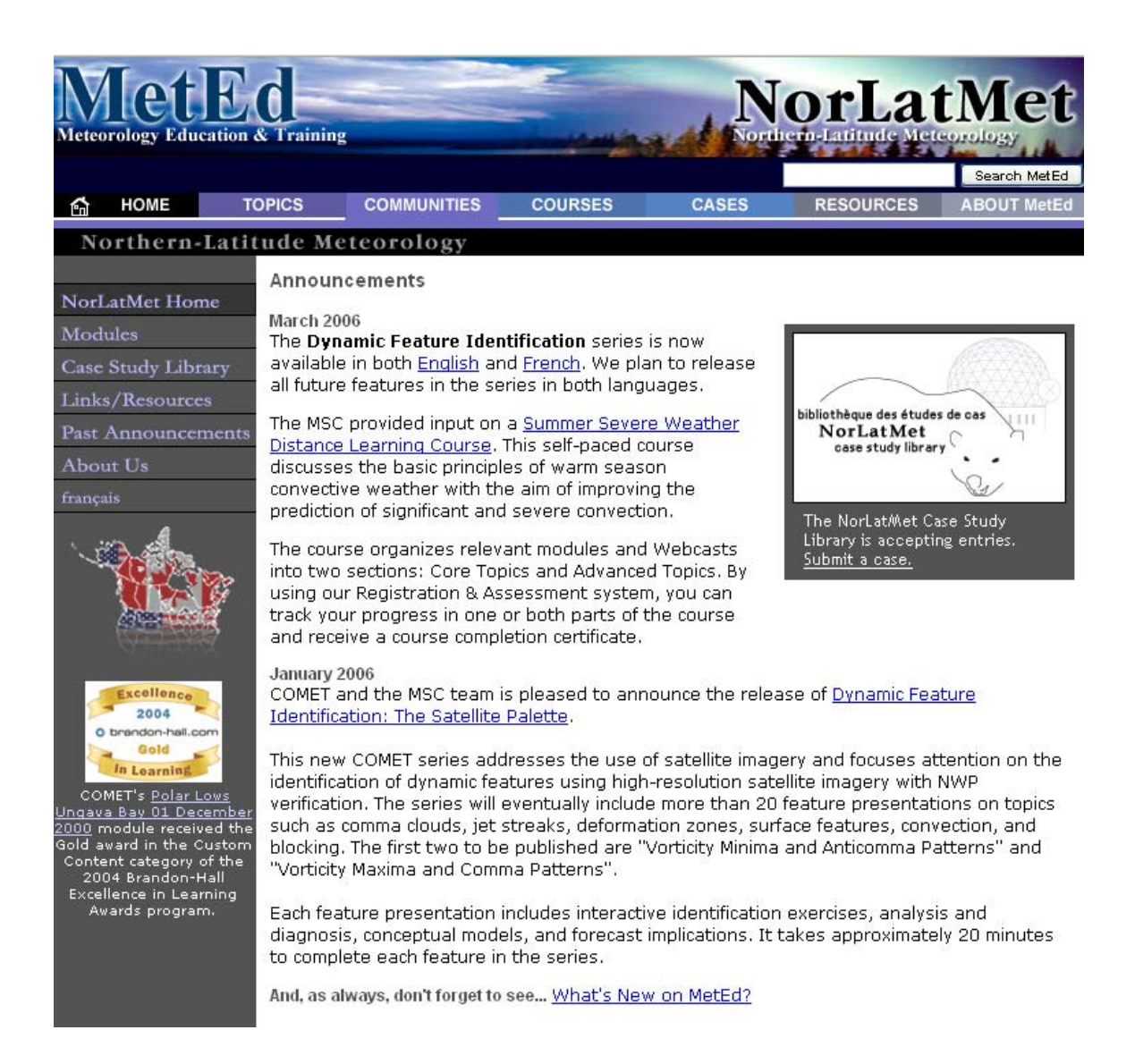
Figure 1. COMET's Northern Latitude Meteorology home page.