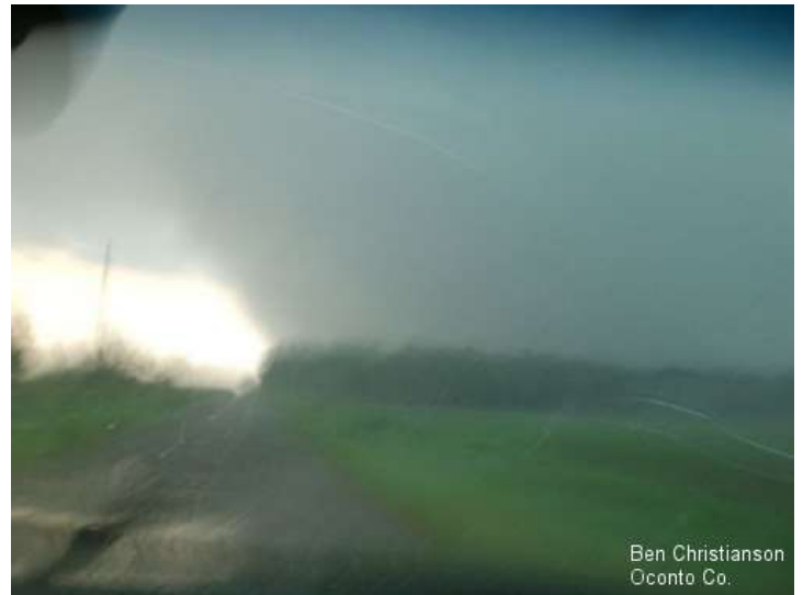
Picture on left: Tornado passing south of White Lake in Langlade Co.