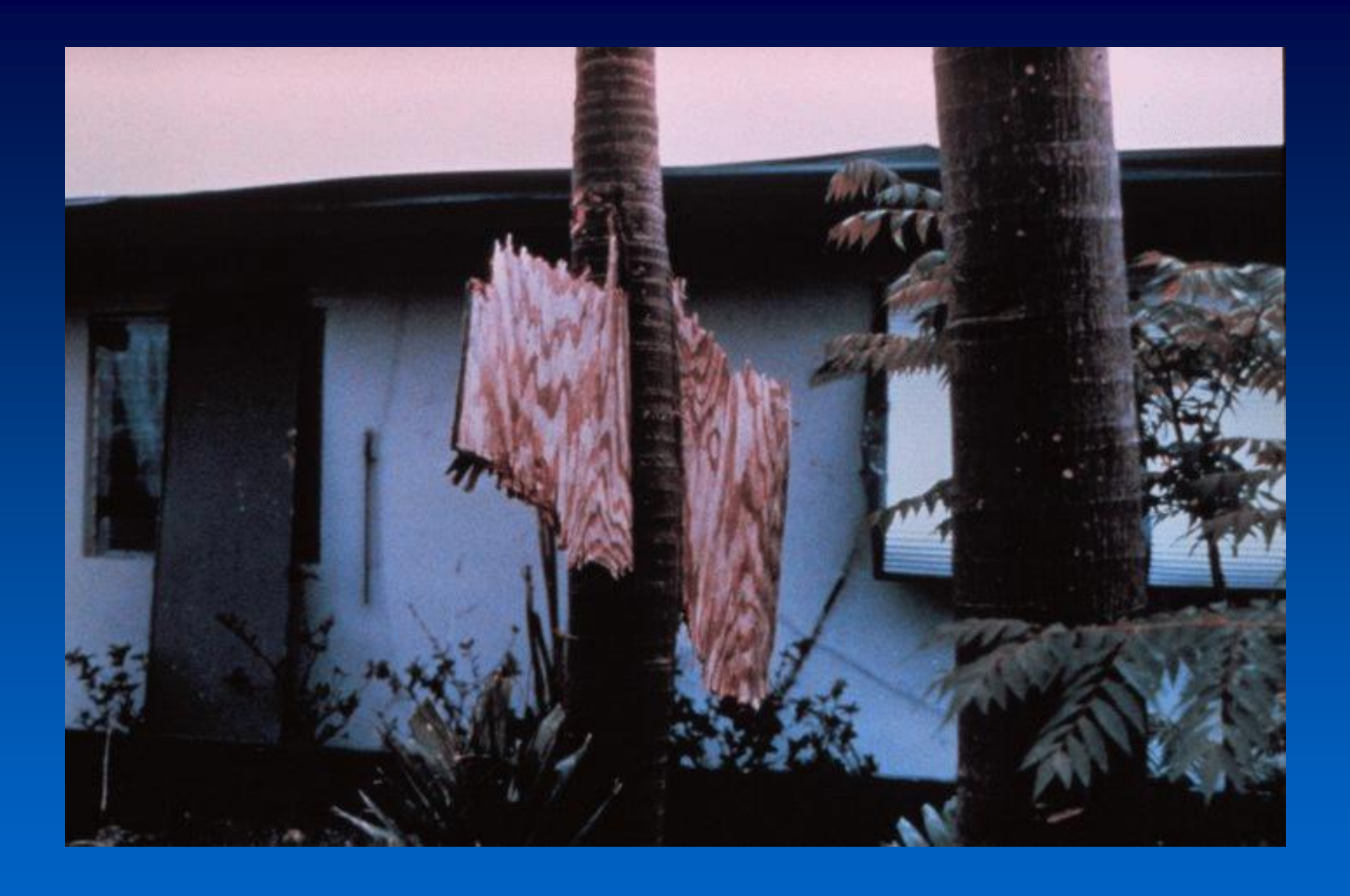
High Wind Threats: Flying Debris, Falling Trees

Winds in a Microburst can be over 100 mph.