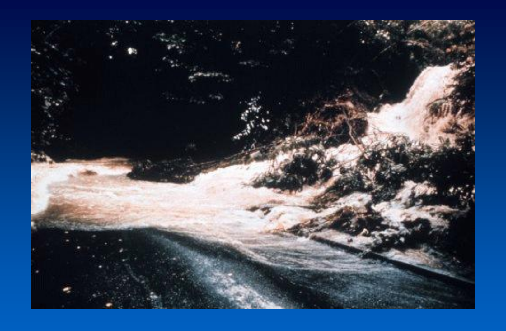
Flash Flood Threats: Washed out, flooded Roads

Only a few inches of flowing water can mean BIG trouble.