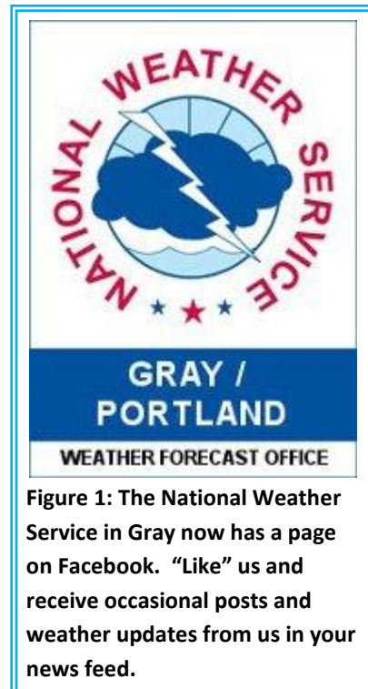
Figure 1: The National Weather Service in Gray now has a page on Facebook. "Like" us and receive occasional posts and weather updates from us in your news feed.

Among other things, the NWS uses its Facebook accounts to communicate upcoming hazardous weather events, gather storm information and damage photos, and announce upcoming spotter training sessions. The office regularly posts interesting weather facts such as rainfall records and other climate information. If you are a member of Facebook, please enter "US National Weather Service Gray ME" in the Search bar and "Like" us! Once you do this you will be able to see our News Feed and post on our homepage.