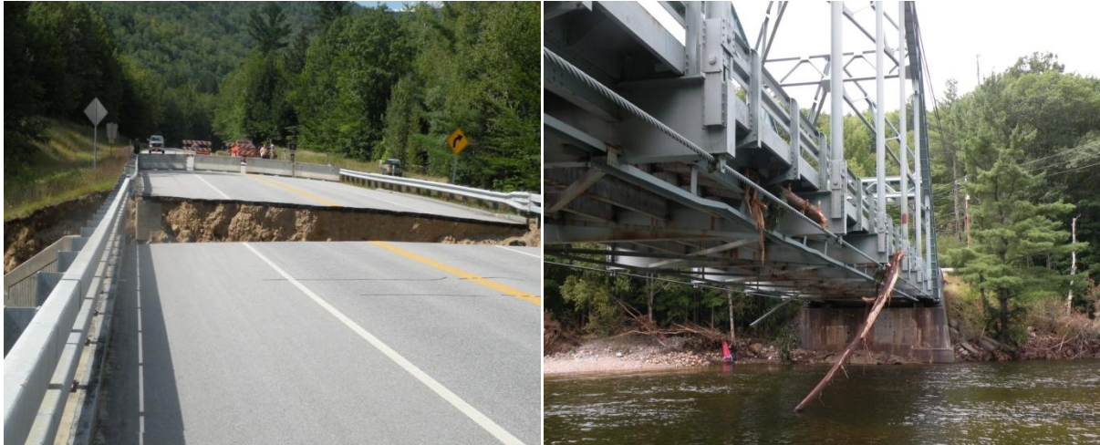
Figure 3: A section of a bridge was washed away on route 302 in Bartlett, New Hampshire (left), while tree trunks mark the high water line on a bridge along route 175 near Woodstock (right).

Woodstock, and Conway (an example of the extreme runoff in Glen, New Hampshire is shown here http://www.youtube.com/watch?v=Vc9QQpcnfeM&feature=related ). National Weather Service follow-up surveys confirmed that water surging through these communities crested even higher than our historic 1987 floods.