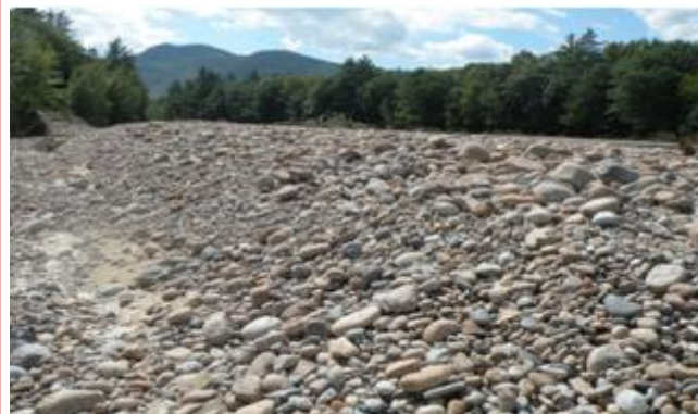
Figure 4: Large piles of cobblestones are noted during a survey of the Saco River in Bartlett after the passage of Irene. This effectively raises the river bottom and creates new flood potential.

The hydrological response to Irene's rains was truly historic in several communities. Impacts involving the intertwined disciplines of meteorology, hydrology and geology remain very complex. It will take several more river surveys, ongoing debates with experts, and future flood events to fully understand the long term effects from Irene on our local rivers.