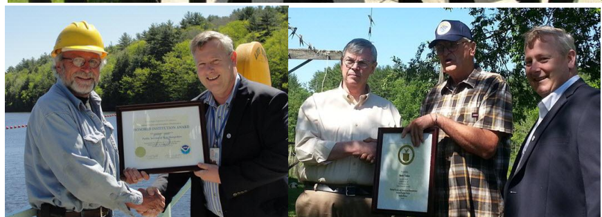
Figure 1: Observers from Hopkinton Everett Lake, NH (top); Bristol, NH (bottom left); and Epping, NH (bottom right) received LOS awards in 2013.