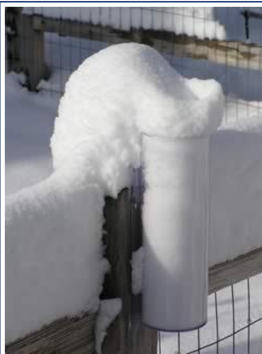
Figure 3: Snow measurement can be one of the hardest parts of weather observations. In this image, a traditional rain gage is buried in snow and would not provide an adequate measurement.

For measuring the water content of snow, the 4" diameter CoCoRaHS precipitation gauge can be used. The inner tube and funnel should be removed and brought inside when temperatures go below freezing. The gauge works well for moderate snowfall amounts up to about 6 to 8 inches, especially if winds are light. Melt the snow that has fallen inside the gauge and use the inner cylinder to measure the water as you would if it had fallen as rain. This is your total precipitation. To speed up the melting process, you can measure an amount of hot water and pour this into the gauge, sloshing it around to accelerate melting. After you measure the resulting water, remember to subtract the total amount of hot water that you poured in. The result is the total precipitation that fell.