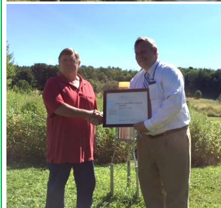
Figure 5: Observers were recognized with Length of Service Awards at Newcastle, ME (top) – 50 years and Dartmouth College, NH (middle) – 125 years. The John Campanius Holm Award was given to the observer in Bath, ME (bottom).