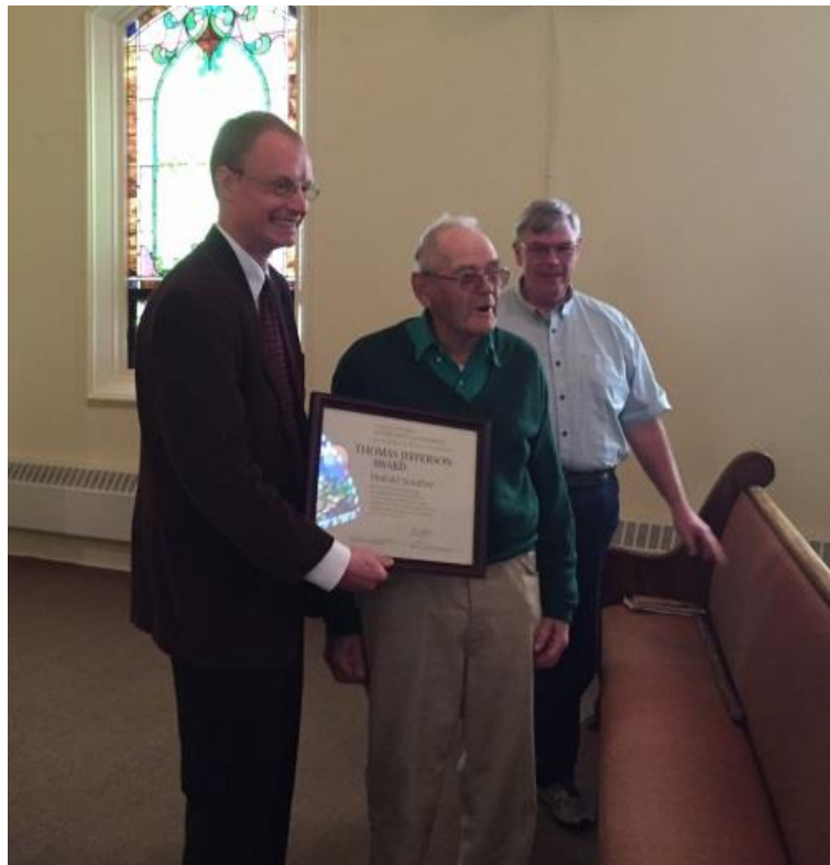
Figure 6: The observer in Livermore Falls, ME receives the Thomas Jefferson Award.