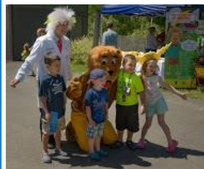
Figure 1: Dr. Lightning and Leon the Lightning Lion visited Storyland in New Hampshire to educate kids about lightning safety.

The park opened after the ceremony and the Lightning Safety Awareness Team greeted children and families from 9:30 a.m. to 12:00 p.m. Leon the Lightning Lion and Dr. Lightning were there to provide safety materials and information. However, it wasn't strictly businesses, as many children got "high fives," hugs, and even their picture taken with Leon and Dr. Lightning. When it was all said and done, Leon was tired, but very thankful that temperatures were actually quite cool for the month of June.