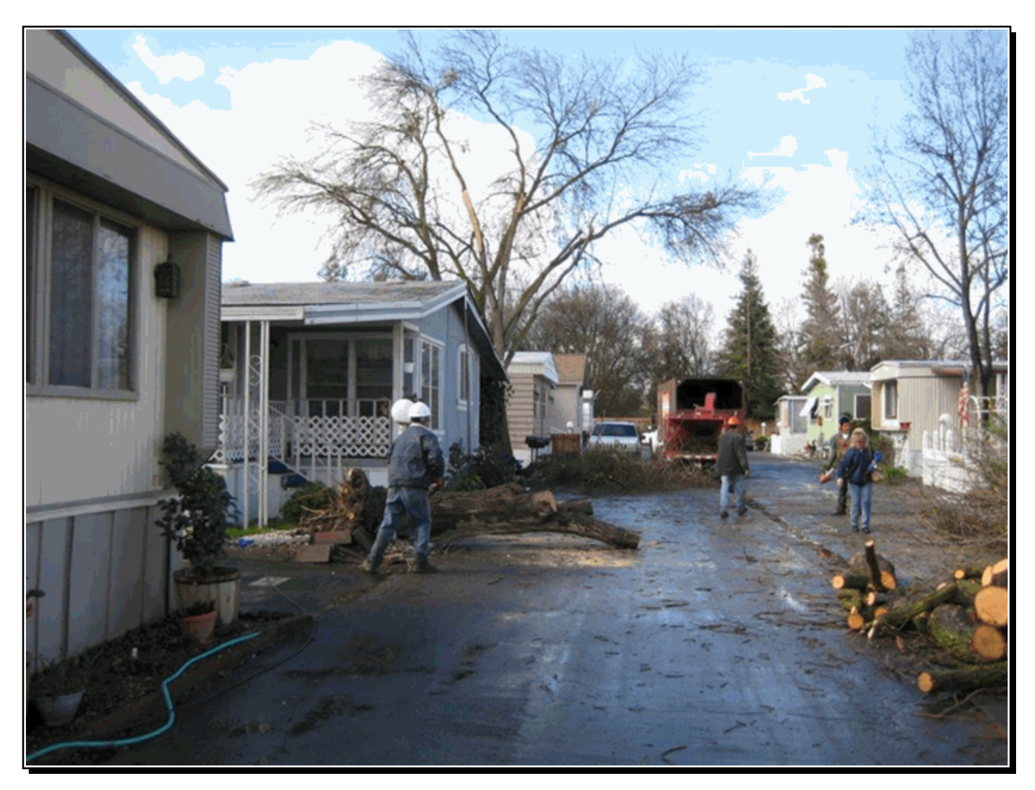
Image shows damage scene at mobile home park the day after the tornado hit. Tops of trees in background of picture show damage.

The large Pacific storm continued through the 28th. Fresno recorded another third of an inch of rain that day, and winds gusted to 33 mph at Fresno-Yosemite International Airport. Very little rain fell over the south end of the Valley, with Bakersfield getting a total of only 0.01 inch of rain for the three-day event, although winds did gust to 37 mph at Meadows Field on the 28th. A weak upper-level low pressure trough, trailing the storm, moved through central California on the 29th, keeping unsettled weather over the region right through the end of the month.