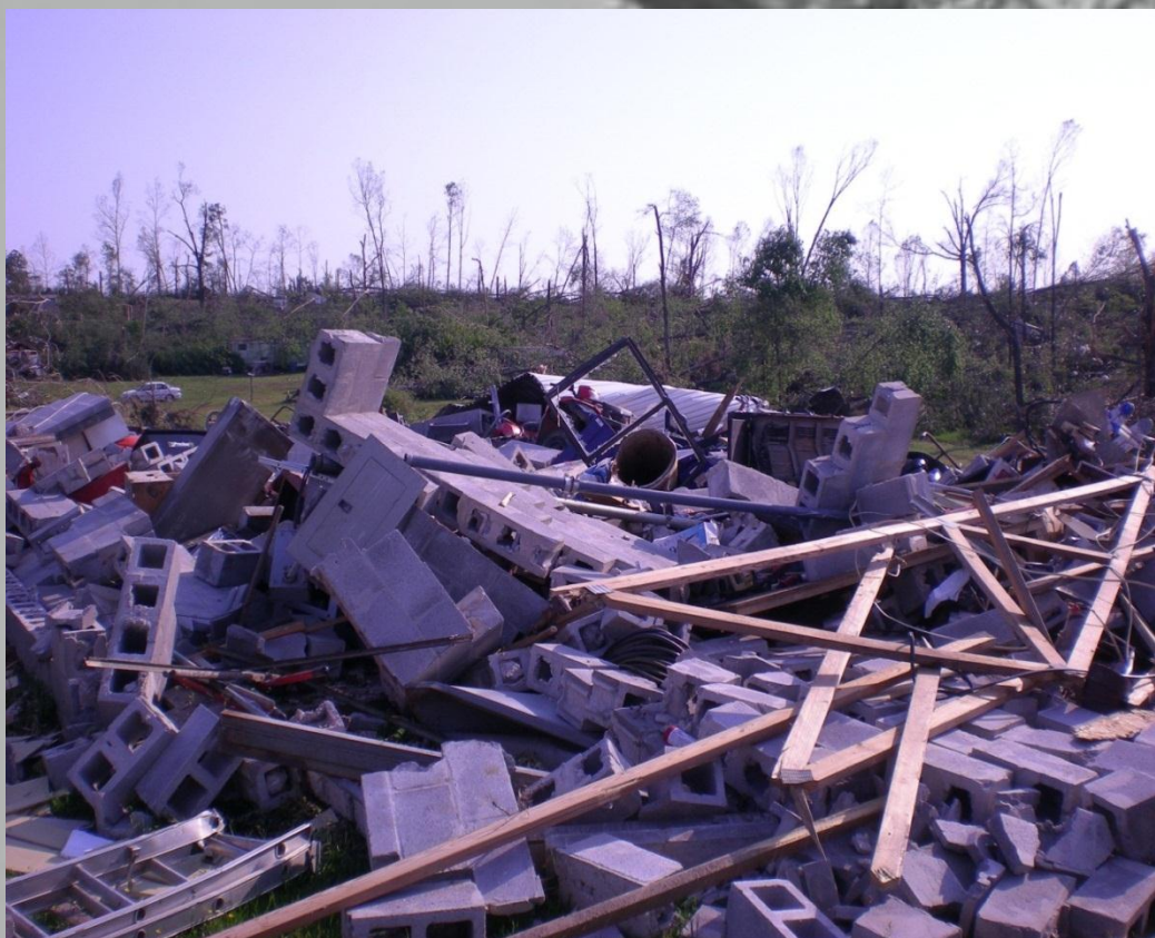
Damage photos shown here display a vehicle that was thrown across a resident's property, as well as another dwelling that was completely destroyed.