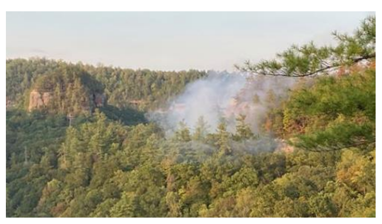
Sky Bridge Fire in Red River Gorge

Burn bans were in effect for most counties in eastern Kentucky at the beginning of the month, with many of these being lifted into the second week of October. According to the United States Forest Service, wildfire danger was very high throughout the drought region. The United States Forest Service also implemented fire restrictions in the Daniel Boone National Forest.