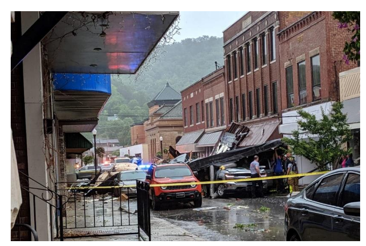
A portion of the roof of the Hock Shop on West Court Street

Elsewhere, from West Liberty and Jackson eastward through Pike County, mainly tree damage was sustained. In Letcher County, a rotating supercell produced quarter to golf ball sized hail near Jenkins, while Somerset experienced isolated damage from a thunderstorm wind gust on the southwest flank of the line of storms.