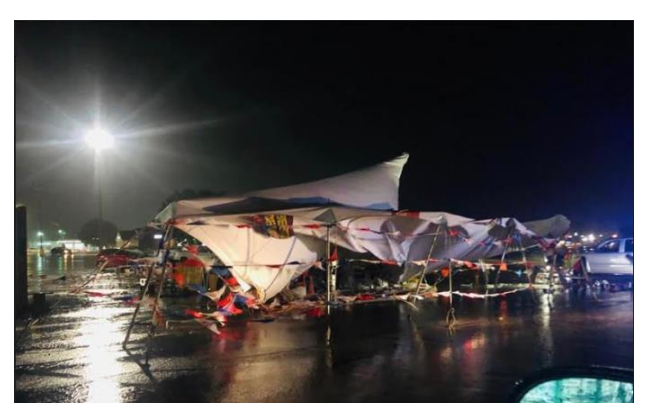
June 21st collapsed firework tent in Monticello

A Series of Mesoscale Convective Systems (MCS) tracked across eastern Kentucky on June 21<sup>st</sup>, 23<sup>rd</sup>, and 24<sup>th</sup>, producing damaging wind gusts. The result of these 3 rounds of storms were many power outages and lots of tree damage. The event on the 24<sup>th</sup> saw many trees landing on residences, causing some damage to buildings. Fortunately, no injuries were reported during all 3 events.