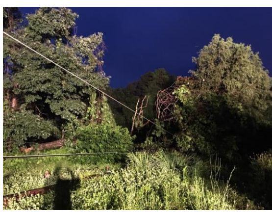
June 23<sup>rd</sup> East Bernstadt wind damage