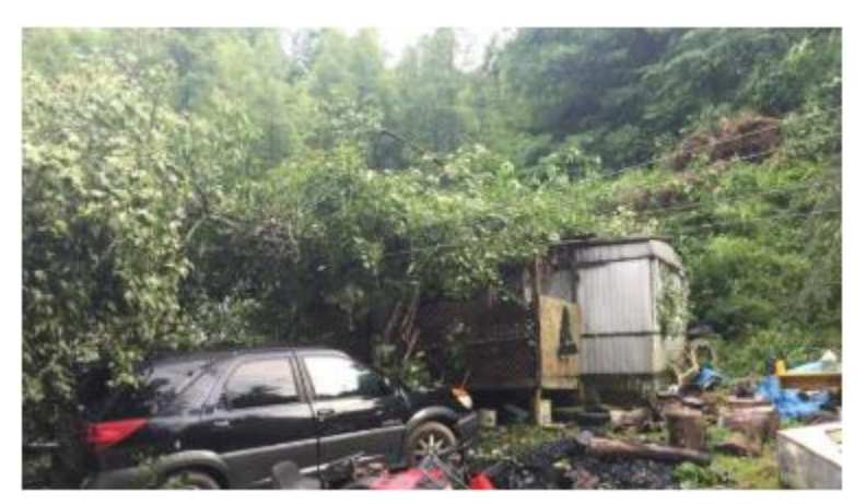
June 24^{th} A tree and power lines blown onto a home in Island City.

For more info.: June 21st, 23rd, and 24th Wind Damage