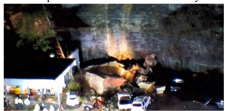
Pikeville in Pike County, KY

February 22<sup>nd</sup>, resulting in several cars and a building being damaged. Other impacts included countless roads being inundated with standing water, pavement and water pipes breaking, water threatening homes,