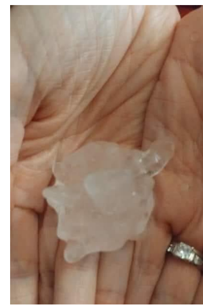
Approximately golf ball sized hail in Jenkins.