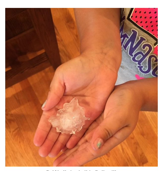
Golf ball size hail in Polksville

For more info.: June 5th significant hail and damaging winds