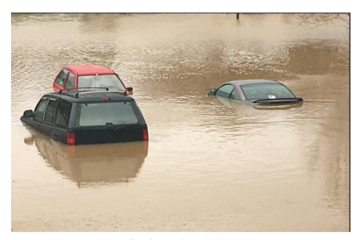
Flooding in Rockcastle County.

majority of the flooding and flash flooding issues across eastern Kentucky. Showers and thunderstorms capable of heavy rainfall trained over parts of Wayne, Pulaski, Rockcastle, and other counties along the I-75 corridor, resulting in deadly flash flooding and river flooding along the Cumberland River. Later in