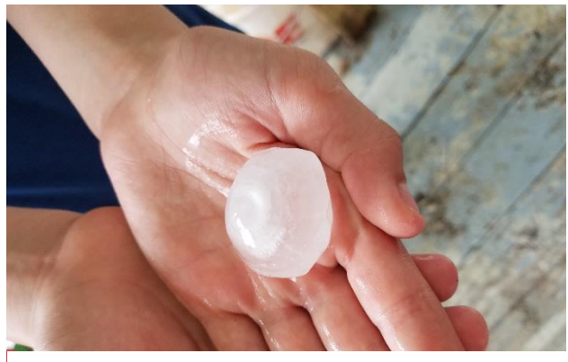
2 inch hail near Hazel Green

Significant hail up to 2 inches in diameter was reported in Wolfe County with the early evening storms. There were also numerous trees blown down in areas, generally along and north of the Mountain Parkway.