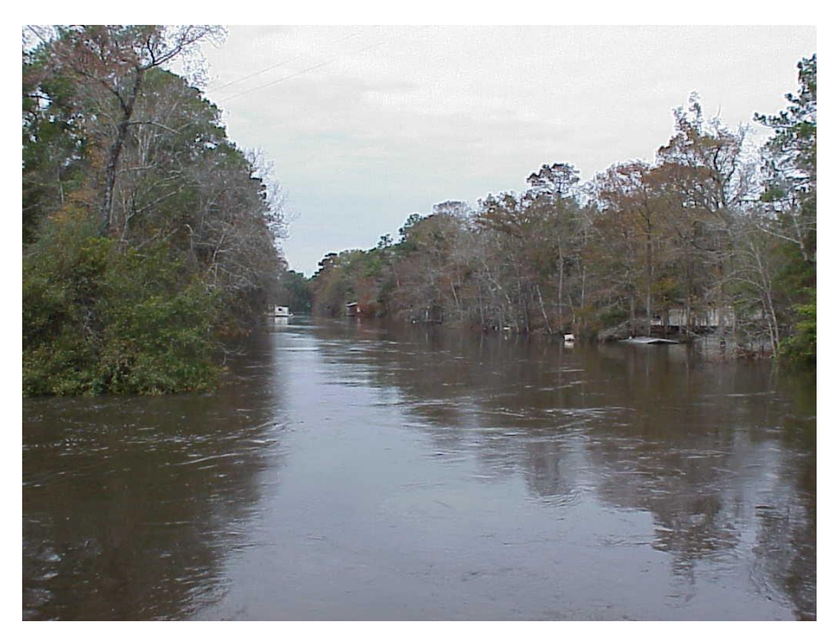
Flooding along the West Fork of the Calcasieu River