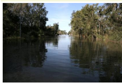
Joe Miller Road in Moss Bluff, LA is completely submerged