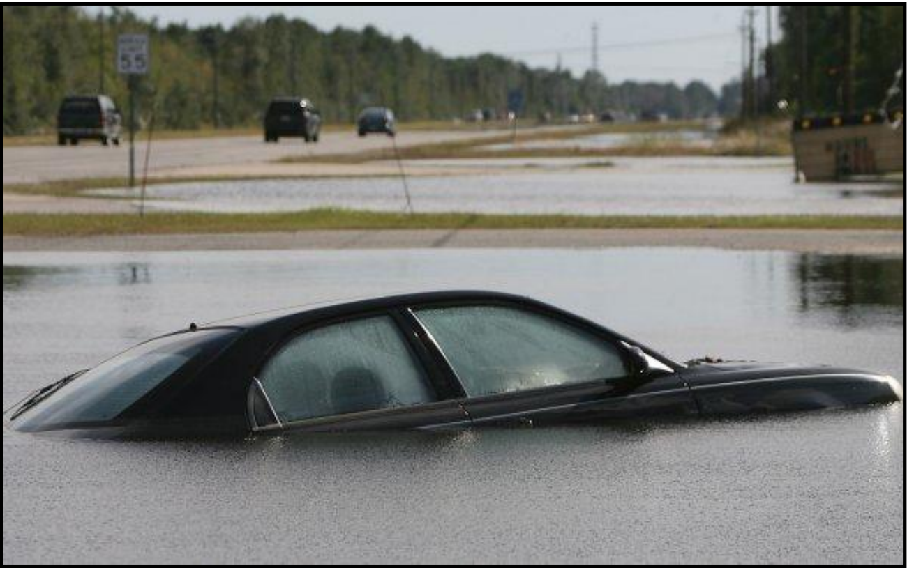
A car is submerged by flood waters along U.S. 171 in Moss Bluff, LA on October 28, 2006

by Sam Shamburger, Journeyman Forecaster