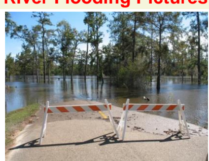
Areas of Sam Houston Jones State Park near the Calcasieu River are underwater