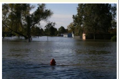
An entire neighborhood in Moss Bluff is flooded