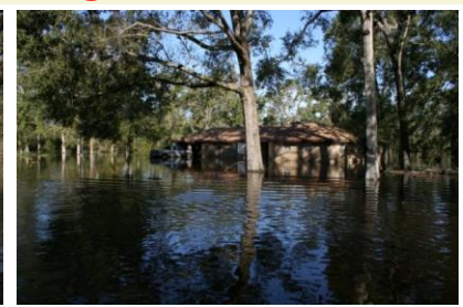
A house on Joe Miller Road is inundated by flood waters