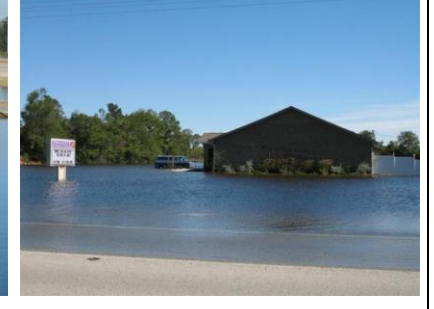
A church along Highway 171 is engulfed by flood waters