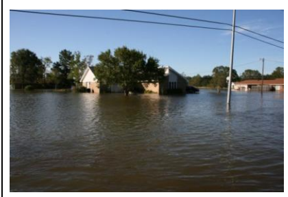
Flooding engulfs this house on Joe Miller Road