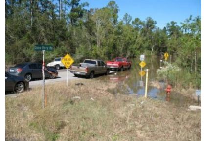
The entrance to Goos Ferry Road in Lake Charles is blocked by flooding