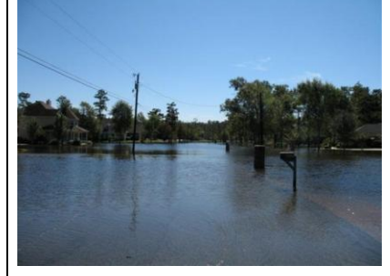
West Armand street in Moss Bluff, LA is completely submerged