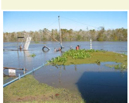
An industrial dock along the Calcasieu River at Old Town Bay is almost completely submerged