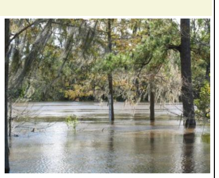
River gage at Sam Houston Jones State Park showing the flooded river at a level over 9 feet high on 10/27