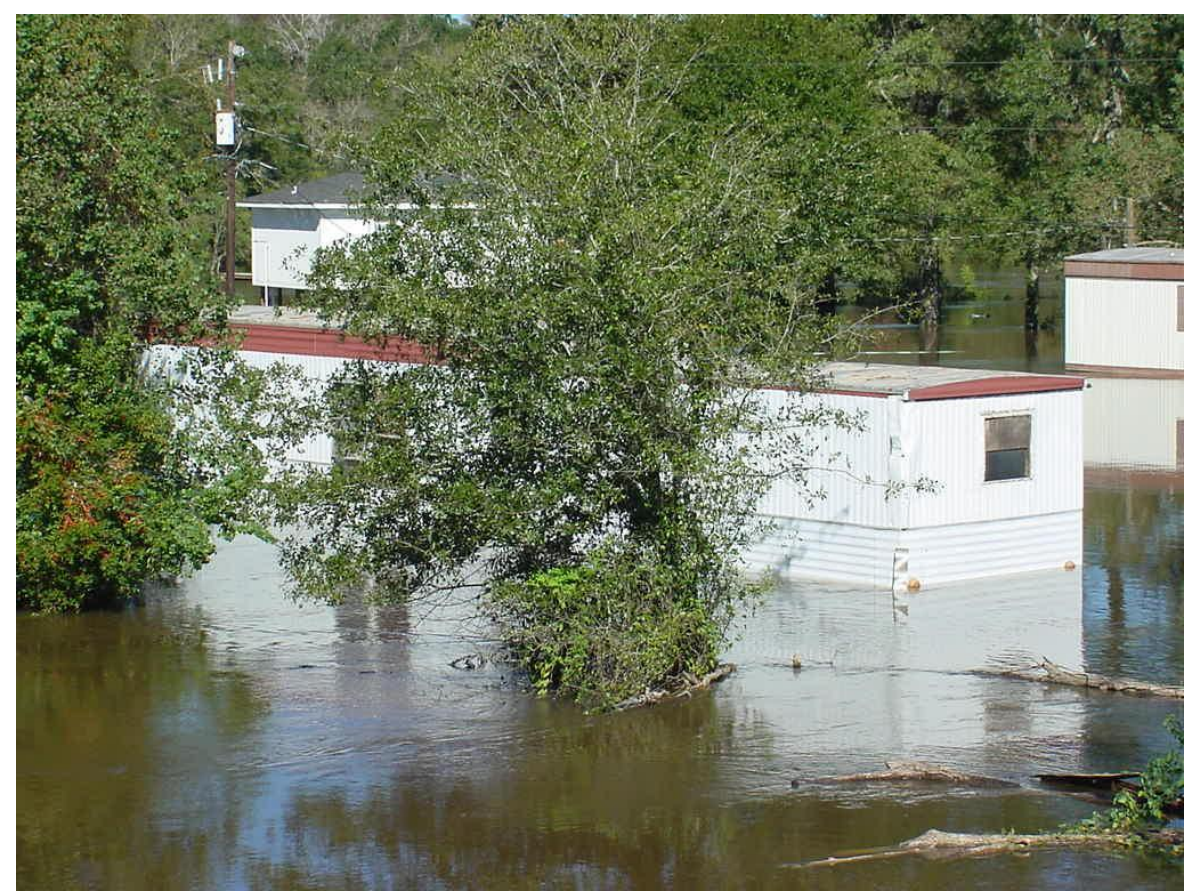
Calcasieu River at Oberlin