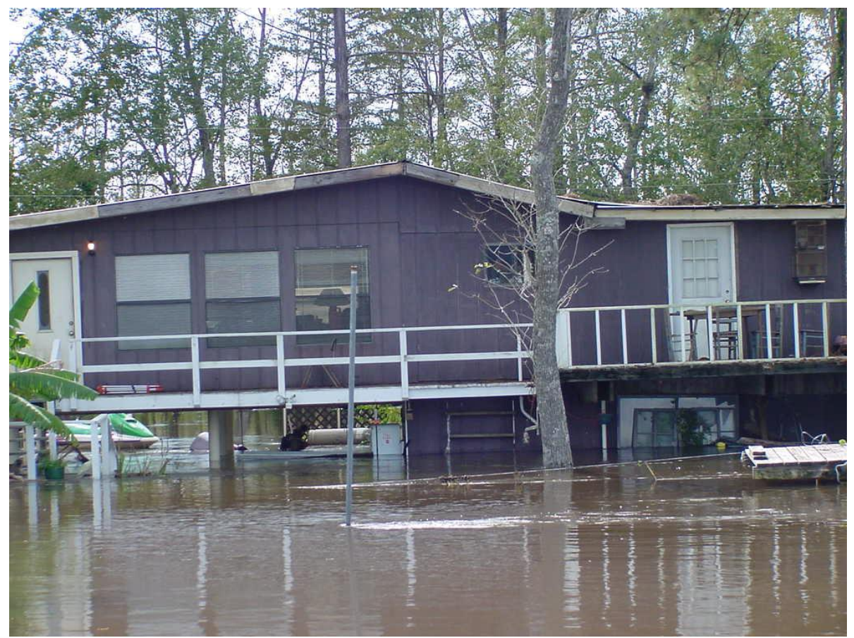
Calcasieu River near Old Town Bay