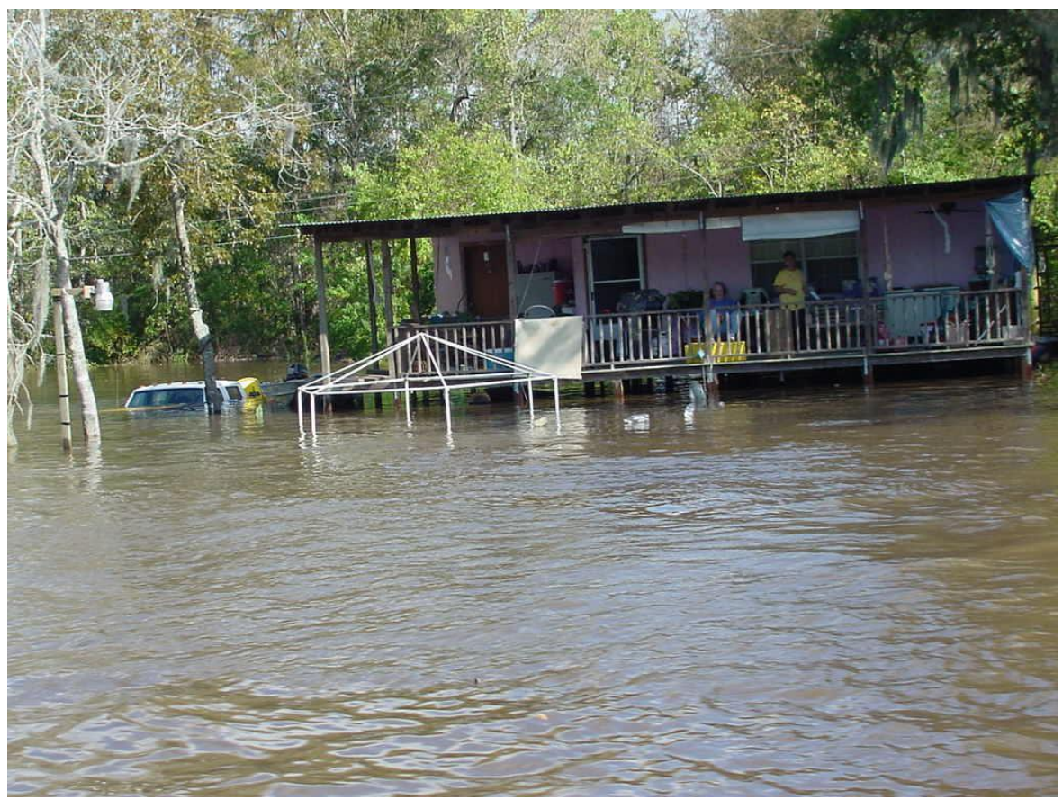
Calcasieu River near Old Town Bay