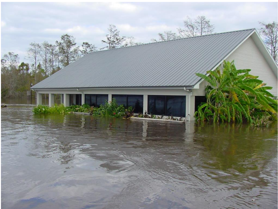
Calcasieu River near Old Town Bay