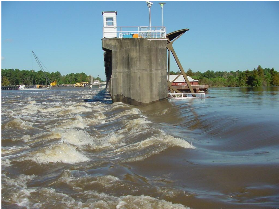
Calcasieu River at Salt Water Barrier