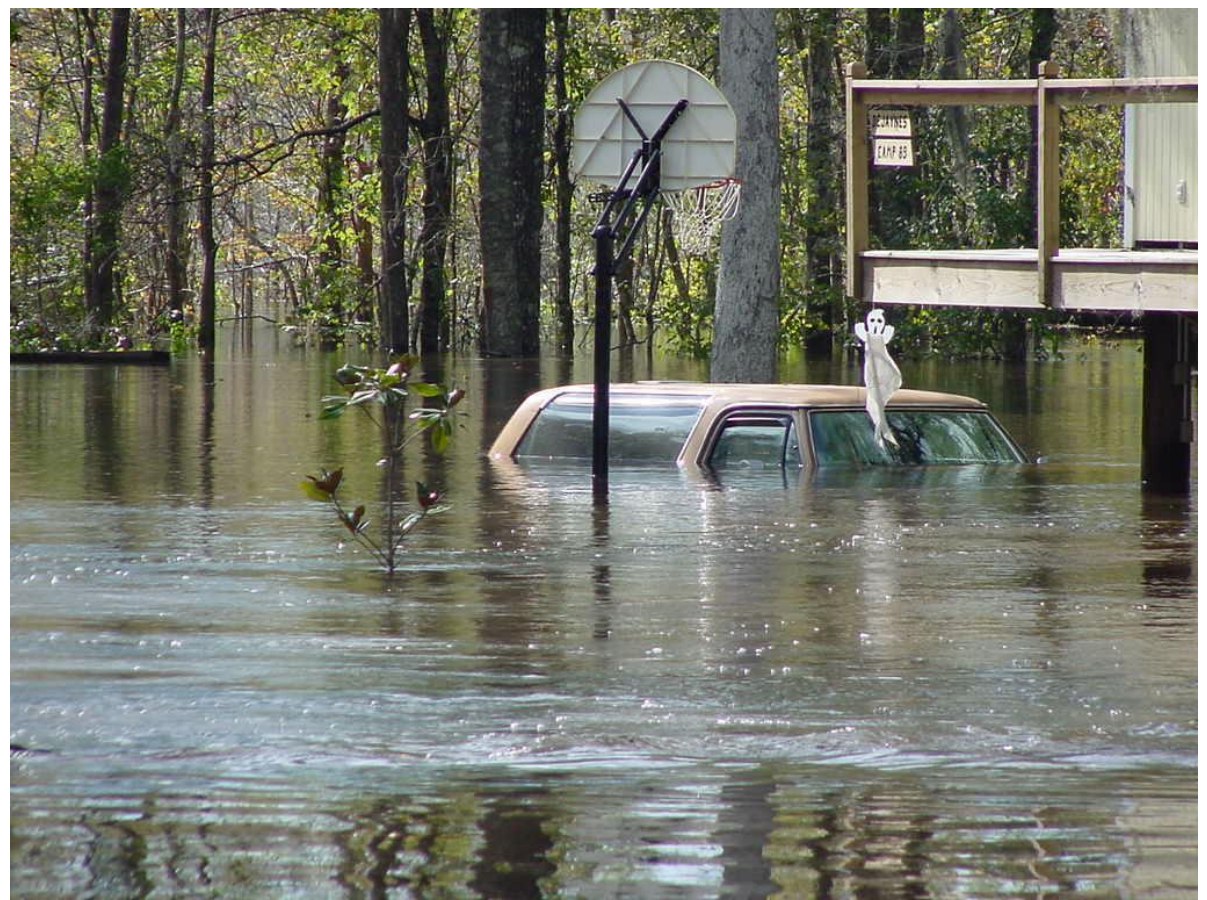
Calcasieu River near Old Town Bay