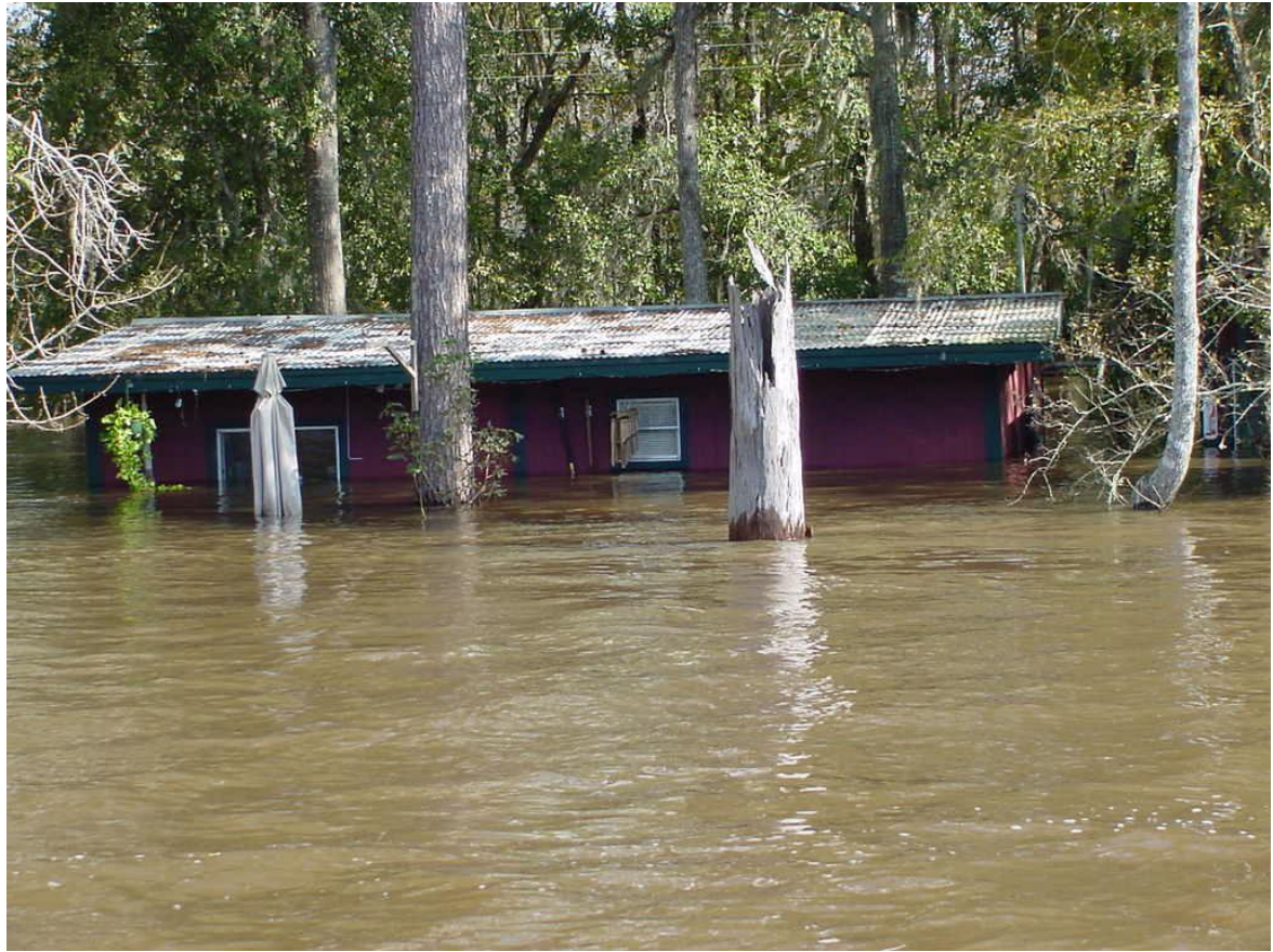
Calcasieu River near Old Town Bay