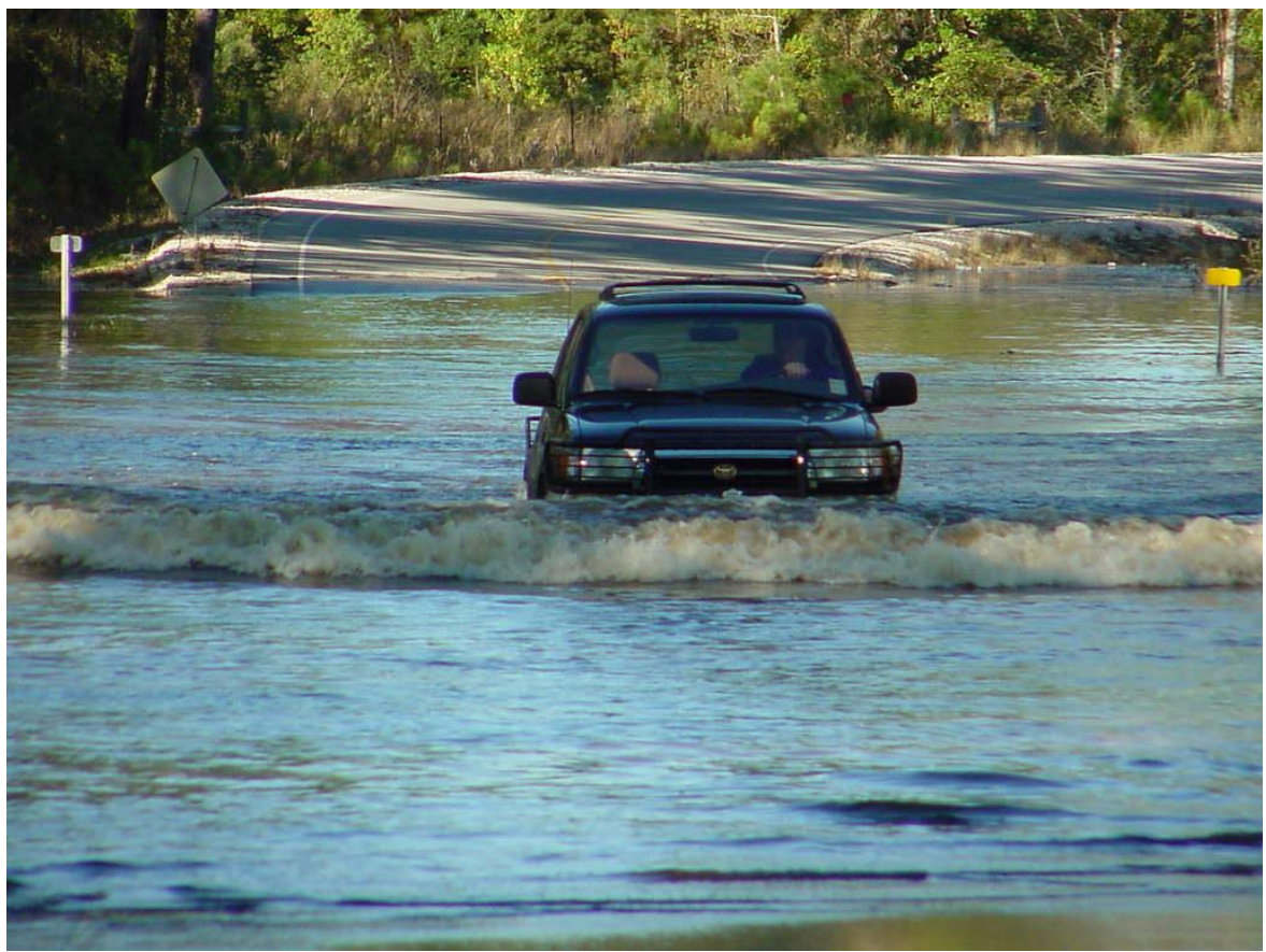
Calcasieu River near Old Town Bay