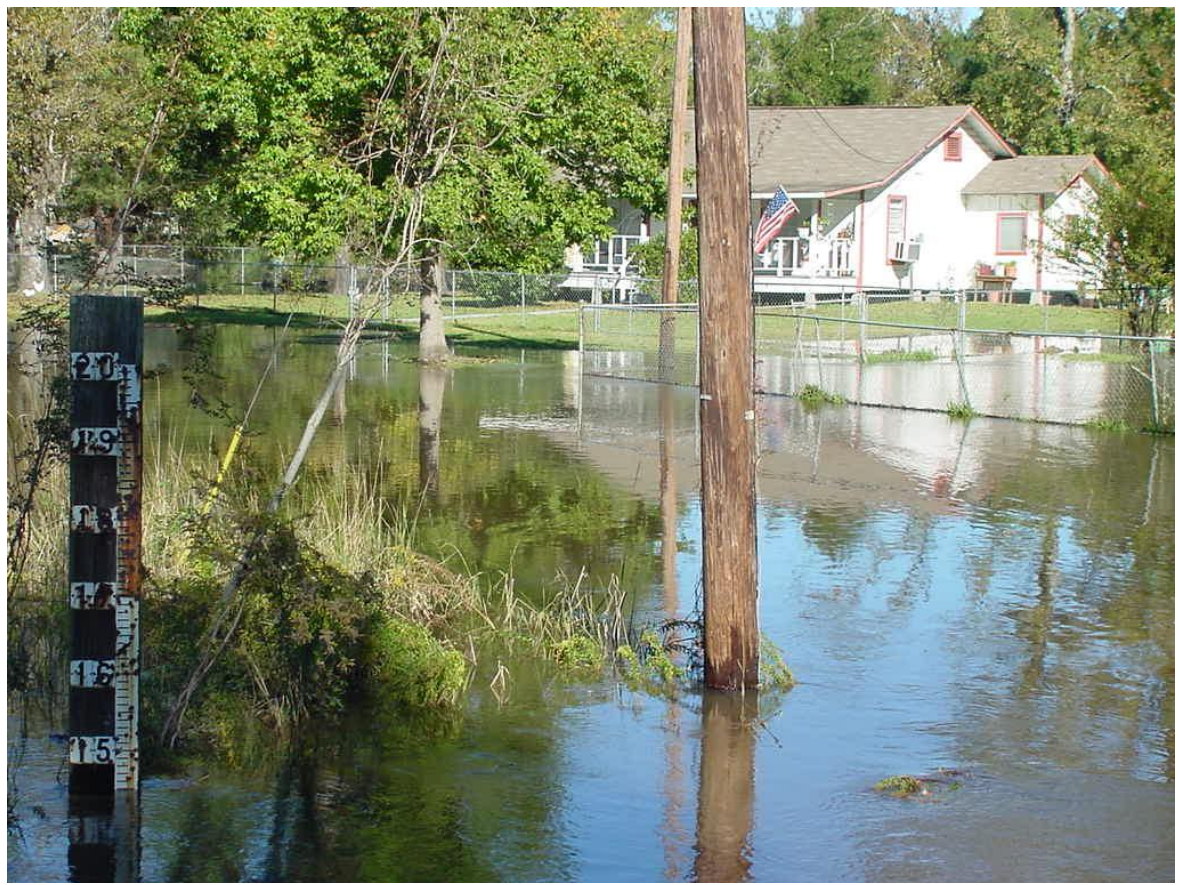
Calcasieu River at Oakdale