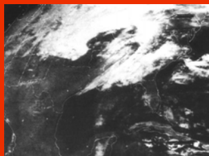
Cloud cover over the U.S. on April 3, 1974 taken by an Applications Technology Satellite 3.

-Brandenburg newspaper editor, April 4, 1974