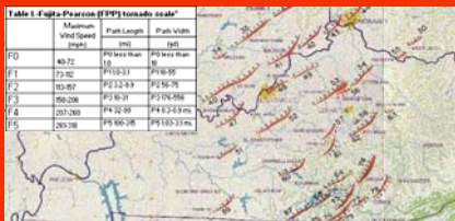
Tornado paths over Kentucky and southern Indiana on April 3, 1974

In all, tornadoes affected 39 counties across Kentucky on April 3, which killed 77 people, injured 1,377, and affected 1,800 farms and 6,625 families. The state suffered 110 million dollars in damages.