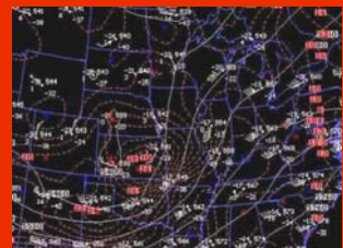
500 mb (18,000 ft) chart at 7 am April 3, 1974. A strong storm system was approaching Kentucky.