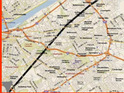
Estimated path of the April 3, 1974 Louisville tornado