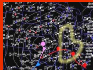
Surface chart at 7 am April 3, 1974. Area in yellow is where the majority of tornadoes occurred.