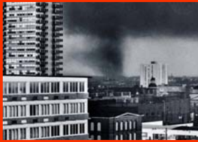
A photograph of the Louisville tornado taken from the roof of the Courier-Journal.