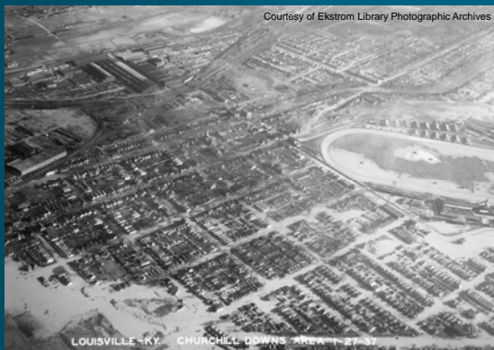
Widespread flooding at and around Churchill Downs.