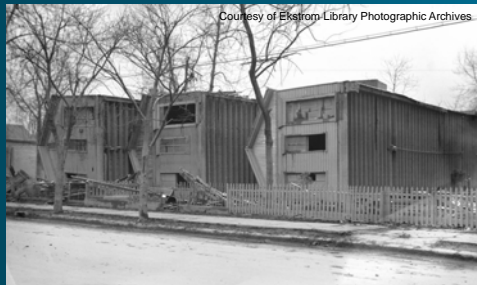
Houses flipped in a Louisville neighborhood.