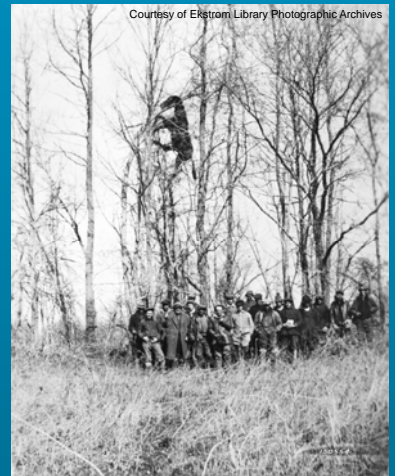
Horse caught in branches of a tree several weeks after flood crest.

At midnight their worst fears were realized. The whistles began to blow, warning everyone to leave the city. Sirens at the fire stations screamed out into the night. The Branham family, and thousands of others were forced to flee for their lives.