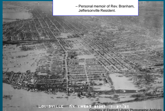
Inundation of western Louisville looking east toward downtown.

Much of the excessive rains across the lower Ohio Valley came in the 11 day period from January 13-24. Over 16 inches of rain fell along and south of the Ohio River from Cairo, Illinois to Louisville. In Louisville, the river rose 6.3 feet on the 21 st of the month. Ninety percent of the homes in Jeffersonville, Indiana were flooded. Perhaps the most completely damaged town on the river was Portsmouth, Ohio. Many homes there were damaged by the force of rushing water topping the town's floodwall. Flood waters exceeded the town's 60 foot wall by 14 feet! Cairo, Illinois, on the other hand, stayed safe behind its new 60 foot wall as the crest of the river rose to 59.6 feet, a rise to a mere 0.4 feet below the wall's top.