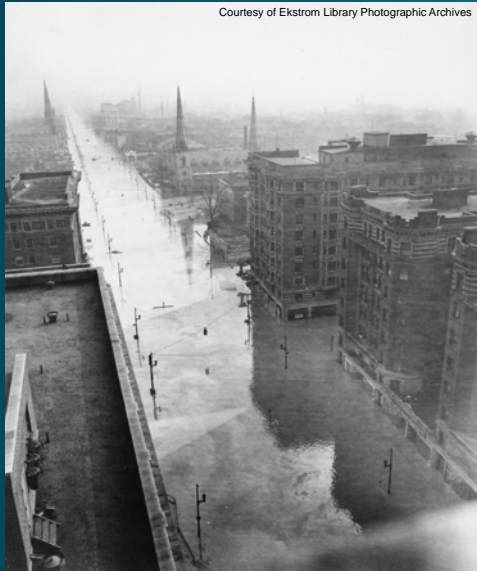
Looking east down Main Street.

The Ohio River Great Flood of January 1937 surpassed all previous floods during the 175 years of civilized occupancy of the lower Ohio Valley. Exceeding the floods of 1884 and 1773, geological evidence suggests that the lower Ohio Valley flood of 1937 outmatched ANY previous flood. The whole city of Paducah was inundated; 35,000 people were evacuated. Seventy percent of Louisville was submerged, forcing 175,000 residents to flee. One estimate of damage, in 1937 dollars, was 250 million!