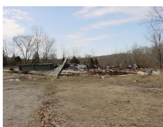
Mine La Motte, Mo