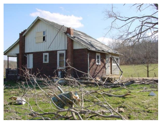
Patterson Mountain, Mo