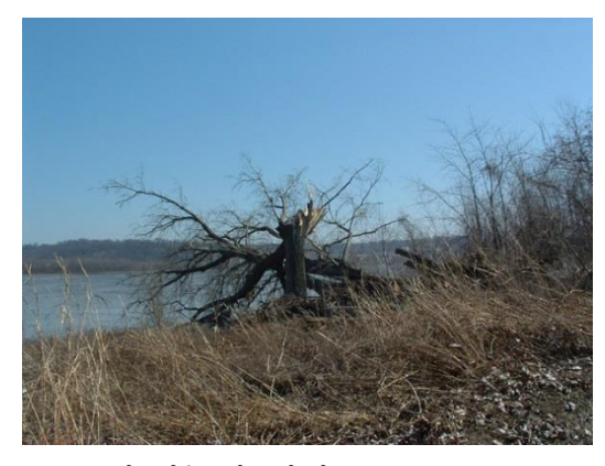
Kaskaskia Island, Il