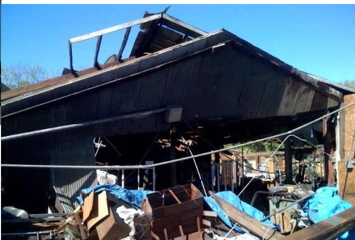
Tornado damage just south of Palmyra, Missouri (Marion County), near Business 61 and U.S. Highway 61.