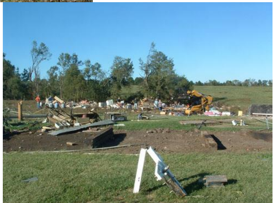
EF2 Tornado damage on Highway PP in Monroe County. Single wide mobile home completely destroyed.