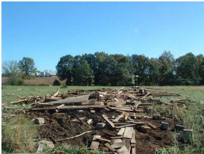
Large outbuilding completely destroyed by EF0 tornado in Montgomery County.

The tornado touched down near the intersection of County Roads 165 and 168. It travelled to the northeast destroying one outbuilding and damaging or destroying numerous trees. Also, the southeast corner of a hog confinement building was damaged, leading to a partial roof collapse. Some of the debris was thrown a third of a mile to the northeast. An unoccupied car was also damaged. The tornado lifted and dissipated on County Road 160 about a quarter of a mile south of County Road 164. The path length of the tornado was 2.1 miles and the max path width was 40 yards. The tornado was rated as an EF0.