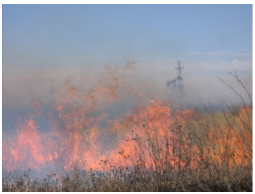
Flames scorched open rangeland in Cochran County on the 13th. An 8,000 acre wildfire ignited south of Morton during high winds and adverse fire weather conditions on the afternoon of the 12th, destroying two homes. Residual fires in southern Cochran County burned through the night before they were extinguished during the early afternoon hours on the 13th.

Very large wind-driven wildfires burned tens of thousands of acres and destroyed property in association with the high winds on the 12th. At least a half dozen wildfires were sparked during the event, four were significant fires. The two largest fires burned out of control for nearly a week