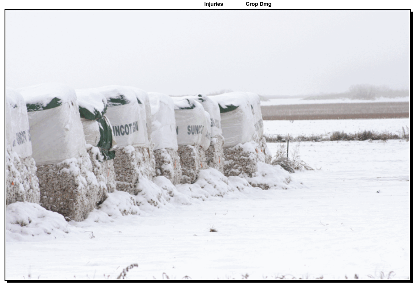
Light snow accumulations covered cotton bales near Denver City (Yoakum County) during winter weather on the 4th.

Location Date/Time Deaths & Property & Event Type and Details