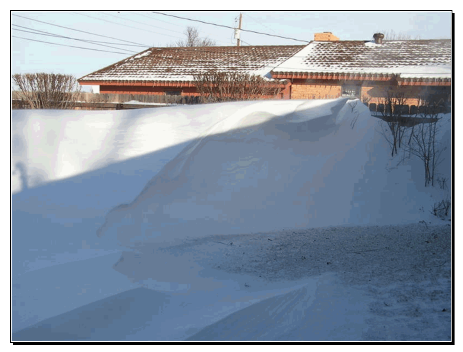
Blizzard conditions in Childress (Childress County) on the 24th resulted in snow drifts greater than eight feet.

Location Date/Time Deaths & Property & Event Type and Details Injuries Crop Dmg