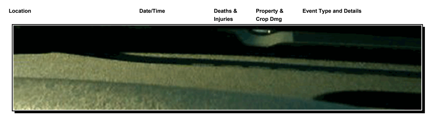
A wind-driven grassland wildfire burned approximately 5,000 acres in Cochran County during the afternoon of the 16th.