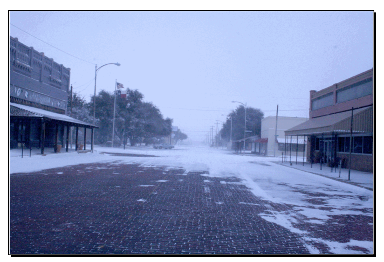
Main Street was virtually abandoned on the morning of the 1st in Childress (Childress County) following the onset of winter weather and bitterly cold temperatures.

The public impacts from the 1-4 February arctic air outbreak on the South Plains of west Texas were high. In all, 2 deaths and at least 6 injuries were blamed on the weather. Total economic losses were estimated to approach $1.4 million.